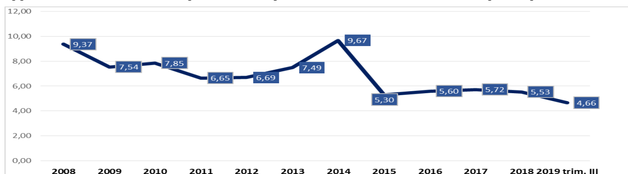
Figure 2 Share of Public Procurements in Gross Domestic Product (%) Source: Developed by the authors based on the Report on the activity in the field of public procurement carried out during 2019 (Uzoma Chikwere et al., 2019, p. 19)

This decrease in public procurement contacts from 25327 to 13,800 units in 2019 compared to 2018, in the volume of 10508.71 million. MDL in 2018 and 8939.88 million. MDL in 2019 is explained by the fact that in Law 131/2015 were introduced the amendments regarding the increase of the application thresholds. Thus, part of the acquisitions or turned into low value public procurements.