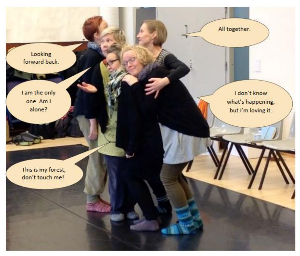
Figure 3. Still image – reflecting on the personal and the other, the relations between individual and social in DESF.

According to their discussion before making their still image, the first person on the left is saying that drama allows for exploration of a wider time perspective on sustainability dilemmas: "looking both to the past and to the future." All the others seem to put forward a different aspect of the relation between the personal and the collective, which is very central in sustainability education. The second person on the left reflects on "being alone, but together," having space for her own thoughts parallel to being part of a group. The third person on the left reflects on how the drama practice changed her personal zone in the forest to become a collective space and how she has a strong feeling of ownership with her own forest at home. The first person on the right reflects upon how drama brings people together and connects people, enabling collective encounters with different issues, and is thus empowering. The second person on the right reflected on how she explored the role of "a bad person" in the roleplay. She played the role of a "free rider," reflecting a careless attitude