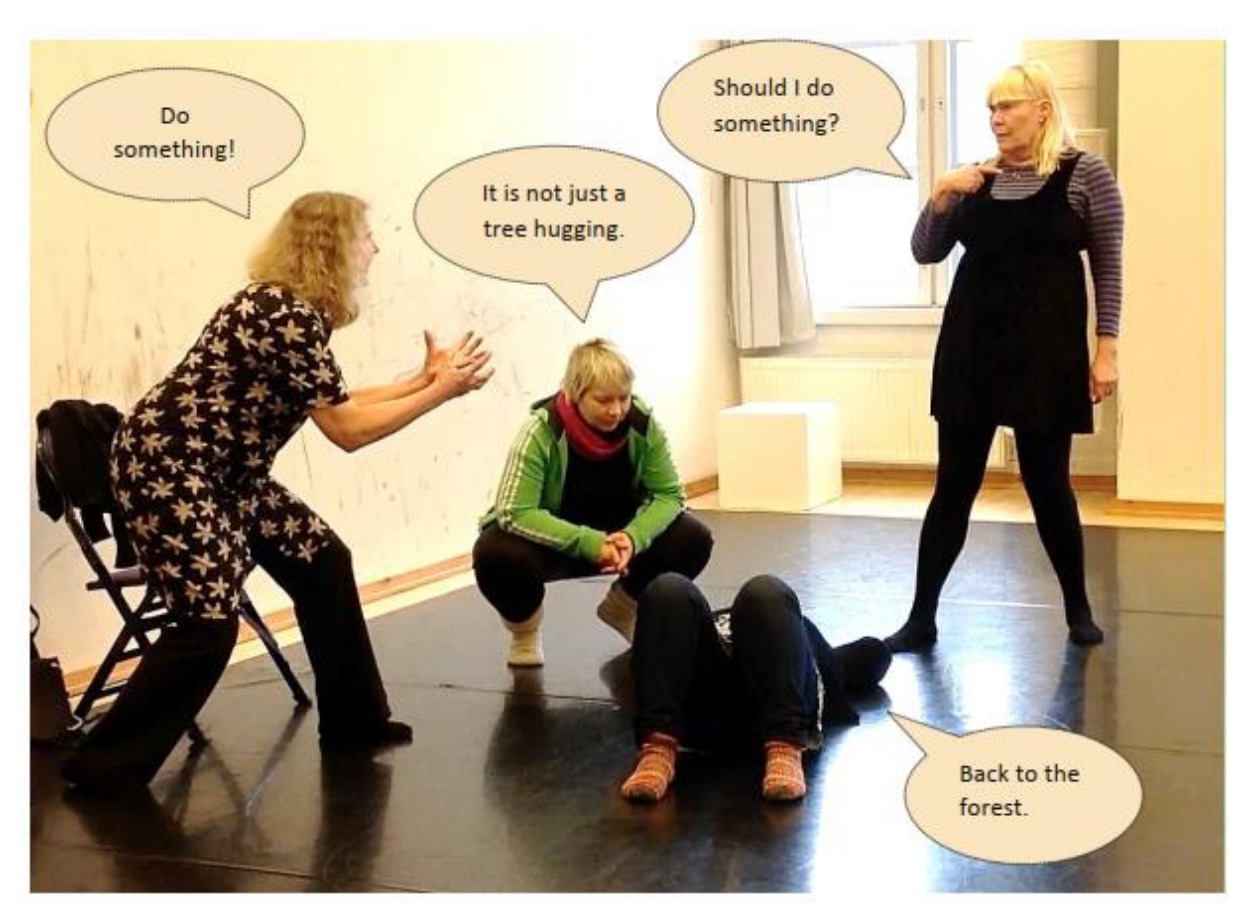
Figure 2. Different aspects of DESF.

Below, we have chosen to present the discussions and preparations related to two of the still images to serve as examples of the students' work. The first example, Figure 2, illustrates different aspects appearing in the group discussions: self-reflection, a critical pedagogical perspective, and a societal perspective. The transformation from the themes of the reflective discussion into a joint still image is also illustrated in Figure 2. The second example (Figure 3, which is presented later) is then discussed and presents the participants' perspectives on the course's theme, "Social Responses to Sustainability." Both of these still images were created during Workshop 3, but the technique was used in other workshops as well.