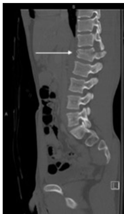
Figure 5 Lumbar spine burst fracture (white arrow).

For treatment of these spine injuries, classic principles hold true. Isolated and stable compression fractures are treated nonoperatively, with bracing indicated for some injuries, depending on location and patient comfort. Burst fractures and other unstable fractures of the spine are treated