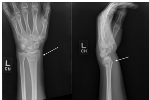
Figure 1 Distal radius fracture (white arrows).

Operatively treated distal radius fractures are typically stabilized after surgery with an irremovable splint for 10–14 days, followed by 4 weeks in a removable brace. 9 As with nonoperative treatment, range-of-motion exercises for the unaffected joints should be started immediately. Beleckas and Calfee recommended active wrist range of motion beginning at 2–6 weeks, depending on fracture severity. 9 At 6 weeks or when radiographic union is noted, passive wrist range of motion should begin and the brace discontinued. 9 The athlete may also begin strengthening exercises at 6 weeks or with evidence of union on X-ray. Most athletes regain the majority of motion and function in the first 3 months of rehabilitation, but often continue to have improvements for at least 1 year. As with nonoperatively treated distal radius fractures, return to sport typically occurs at 6–9 weeks. Henn and Wolfe recommended radiographic healing and at least 80% return to motion and strength prior to return to sport. 10 Beleckas and Calfee discussed returning to snowboarding in a cast prior to fracture healing, with the athlete's understanding that a new fall or collision may result in further injury. 9