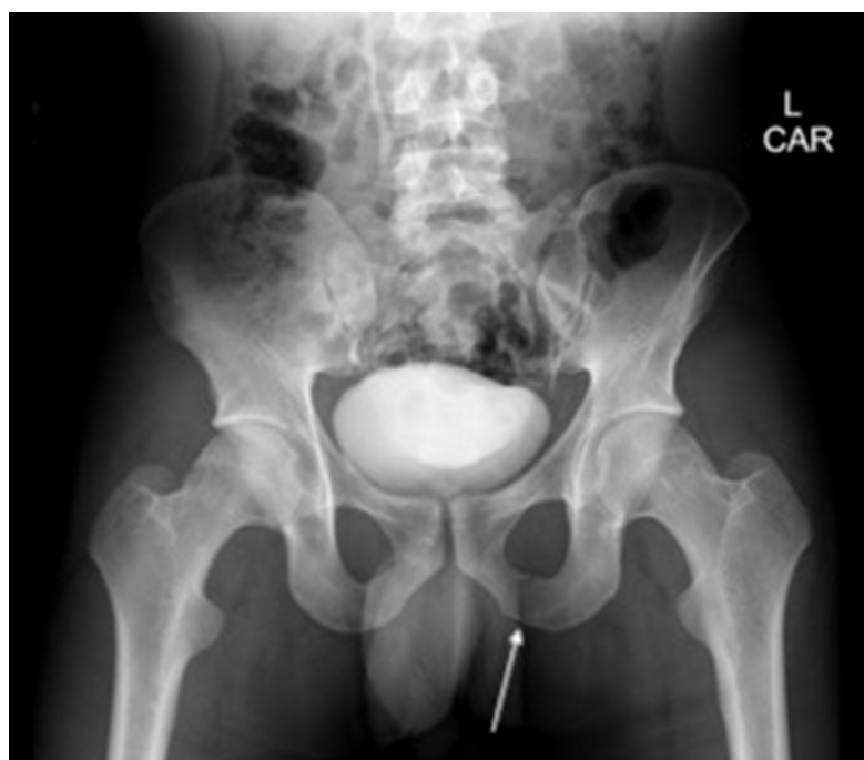
Figure 6 Isolated pubic ramus fracture (white arrow).

In a study evaluating snowboarding-related pelvic trauma, Ogawa et al found that pelvic fractures accounted for 2% of all fractures associated with the sport. 64 Falls and hard landings from jumps are the primary mechanisms of pelvic injury. Collisions with trees and ski towers tend to be less common causes of pelvic fractures, but are associated with more unstable injury patterns. Ogawa et al noted that 85.5% of all pelvic fractures in their series were stable and that pubic and ischial fractures (Figure 6) represented the largest