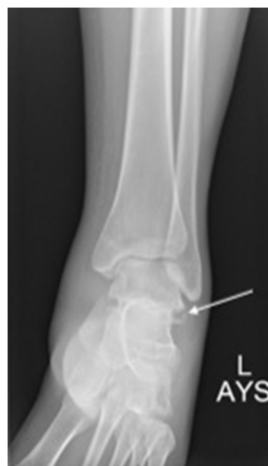
Figure 4 Lateral process of the talus fracture (white arrow).

In Ishimaru et al, 81 of 154 (52.6%) lower-extremity fractures involved the ankle. 28 Most of these ankle fractures in snowboarders occur from a supination–external rotation mechanism resulting in a short oblique fracture of the distal fibula. Patton et al similarly showed that nearly half of all ankle injuries in snowboarders involved fractures, with the majority of the fractures affecting the lead foot. 37 Appropriate management of lateral malleolus fractures depends on concomitant injuries and fracture displacement. Isolated lateral malleolus fractures with <3 mm displacement and no evidence of associated syndesmotomic injury may be