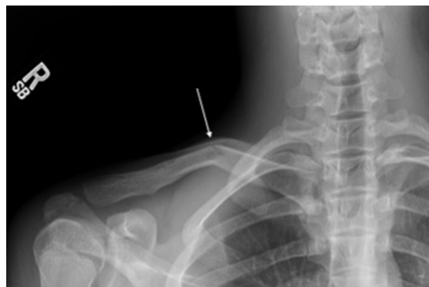
Figure 2 Clavicle fracture (white arrow).

Acromioclavicular (AC) joint injuries (Figure 3) are more common among advanced riders, given the high speed typically needed to cause the injury. 4 Ogawa et al examined the incidence of AC dislocation over five snow seasons retrospectively, and determined an incidence of 17%. 25 AC injuries are typically immobilized for 2–4 weeks. 26 Range of motion of the fingers, wrist, forearm, and elbow can begin immediately. After the period of immobilization, rehabilitation