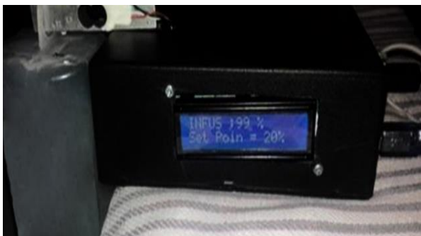
Figure 5. The entire range of hardware during the initial infusion (LCD Display)

From Table 3, it can be concluded that the system works according to the set point setting where the infusion has decreased weight by 10 - 12% every hour until when the percentage value is below 10%, the LED lights up indicating the condition of the liquid is running low and when the percentage value of the weight of the infusion is below 1 %, then the LED and the buzzer will light up indicating that the intravenous fluid must be replaced immediately. In 10 trials, the weight of the infusion detected by the system can vary, such as when the trial lasted for 60 minutes, the weight of the intravenous fluid read was in the range 496 - 486 grams (or in a percentage in the range 88 - 91%). The condition of the LED is on and the Buzzer is also on. It varies but it is still within the specifications according to the programming.