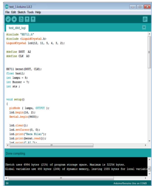
Figure 4. Program compilation

The final step in designing this program system is to test it as a whole. After connecting the Arduino Uno to the computer using a USB cable, the PC is automatically handled by Arduino along with the port used. After that, the Sketch sheet program says "Done compiling". This indicates that the program is running well. The display of this stage can be seen in Figure 4.