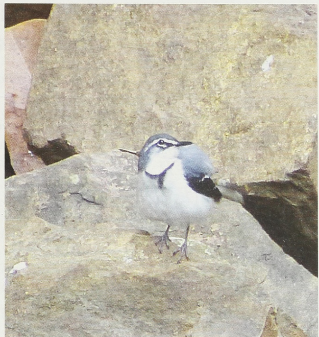
Figures 2–3. Mountain Wagtail Motacilla clara , Dindéfello Nature Reserve, Senegal, 6 March 2015 (L. Pacheco) Bergeronnette à longue queue Motacilla clara , Réserve Naturelle de Dindéfello, Sénégal, 6 mars 2015 (L. Pacheco)

surprising, given its occurrence in the Fouta Djallon highlands of north-central Guinea, c .200 km away (Borrow & Demey 2014). Streams with steep gradients and exposed rocks, its preferred habitat (Tyler 2004), are relatively common in the reserve, unlike in the rest of Senegal. Despite the fact that the waterfall is frequently visited by naturalists and tourists, and that intense bird surveys were conducted in 2011 (Fernández-García et al. 2013), this rather conspicuous species had not been recorded previously, suggesting Mountain Wagtail is probably an irregular or seasonal visitor to the reserve.