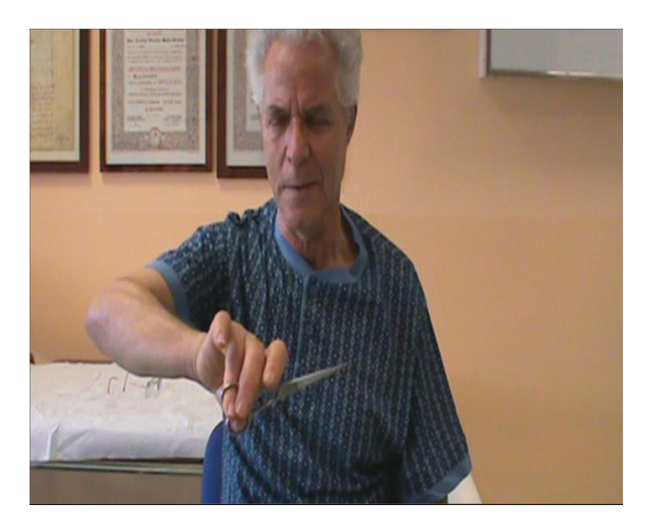
Video 1. Hair cutting dystonia. The patient exhibits extension of the second and fifth finger of the right hand, spasmodic contraction of the muscles of the hand and dystonic posture of the elbow, which slows the cutting procedure. Craniocervical dystonia is present, as well.

cutting hair, we observed extension of the second finger and fifth finger of the right hand and spasmodic contraction of the muscles of the hand. The voluntary posture of the elbow was affected by dystonic contractions and maintained with some effort, thereby inhibiting the cutting procedure (Video 1). Mirror movements emerged in the left unaffected hand during this activity. The patient did not complain of any symptoms while drawing (Video 2). Similarly, no dystonic postures or movements emerged while the patient wrote or held his arms outstretched in a fixed posture in front of his chest (video not available). A neurological examination ruled out the presence of any signs of cerebellar ataxia, akinesia, rigidity or spasticity.