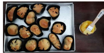
Figure 3. Fluffy bread greased with butter

The group of the Family Welfare Movement of Silo Village (Figure 4) was greatly impressed and interested in this program when they saw the grinding process of dried banana chips to obtain banana flour. The previous program only processed the banana fruits into the fried sweet banana chips and there was no innovative action added. The food products made with banana fruits have been available in some markets, yet interestingly the bakery product from banana fruits to produce gluten-low bread may not have been available in other similar markets. Therefore, this program was carried out to introduce gluten-low bread made with banana fruits. Further, they were also attentive to the bread-making instructions given by the team. In the end, the current program compares with other previous programs conducted in Silo Village showed that the innovative action and accompaniment of participants have been performed properly.