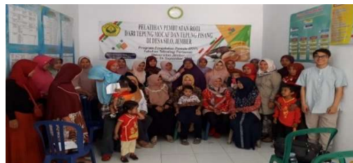
Figure 4. The group of the Family Welfare Movement of Silo Village

The group of the Family Welfare Movement of Silo Village (Figure 4) was greatly impressed and interested in this program when they saw the grinding process of dried banana chips to obtain banana flour. The previous program only processed the banana fruits into the fried sweet banana chips and there was no innovative action added. The food products made with banana fruits have been available in some markets, yet interestingly the bakery product from banana fruits to produce gluten-low bread may not have been available in other similar markets. Therefore, this program was carried out to introduce gluten-low bread made with banana fruits. Further, they were also attentive to the bread-making instructions given by the team. In the end, the current program compares with other previous programs conducted in Silo Village showed that the innovative action and accompaniment of participants have been performed properly.