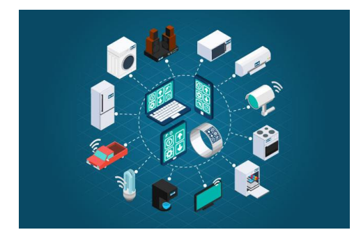
Figure 01 - Universe of possibilities of connection between devices made possible by IoT

Having these flexible features in hand, connected devices have emerged that allow you to build applications by taking advantage of the benefits of connectivity, a trend commonly known as the Internet of Things - IoT. Connectivity between devices occupies a central place in the current technological development. Much found in projects related to home automation among others.