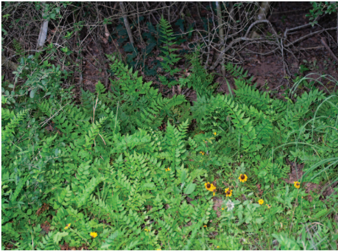
FIG. 1. Portion of a large colony of Cheilanthes viridis growing at edge of grove of Ilex vomitoria , with grasses, Rudbeckia , and Monarda ; Bastrop County, Texas.

in cultivation in gardens or greenhouses. The earliest voucher to document Cheilanthes viridis growing spontaneously dates to 1985 from Georgia. Other reports are all more recent and likely represent independent escapes. The oldest herbarium specimens representing plants in the wild include: South Carolina, 1992; Florida, 1999, Texas, 2019; and Louisiana, 2020. Thus far, specimens from outside of cultivation have only been collected in these five states. Botanists in other southeastern states, as well as in southern California, should be on the lookout for additional naturalized populations. The species was treated for Florida by Wunderlin and Hansen (2000), who did not cite specimens or comment that this represented the first report of the taxon for North America. The Georgia occurrence was included by Weakley (2012) in his regional floristic treatment of southeastern states.