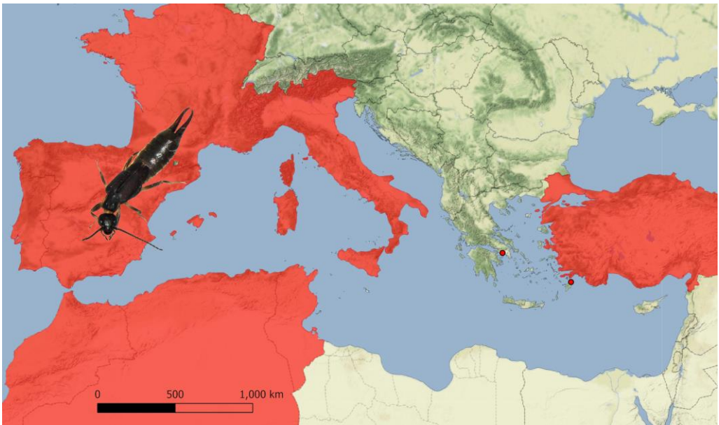
FIG. 1: Known distribution of Nala lividipes (Dufour, 1820) in the Mediterranean basin. Countries where the species has been previously reported are shaded red, while the new records from Greece are depicted with a dot. The map was created with QGIS, v.3.14.16. Inset: The adult, female individual observed on Salamis island, Greece.

anticipation of further additions. Citizen scientists have been supplementing our knowledge around the presence and distribution of alien species, providing photographic observations and specimens of new alien to the country insects such as the feather-legged fly Trichopoda pictipennis Bigot, 1876 and lantana plum moth Lantanophaga pusillidactylus (Walker, 1864) (Demetriou et al. 2020; Kazilas et al. 2020; Dios et al. 2021). Alientoma, an online database for the alien insects of Greece, promoting public participation in scientific research (Kalaentzis et al. 2021b, c), was utilised to track the presence of N. lividipes in the country. In this publication, the black field earwig N. lividipes is reported for Greece for the first time.