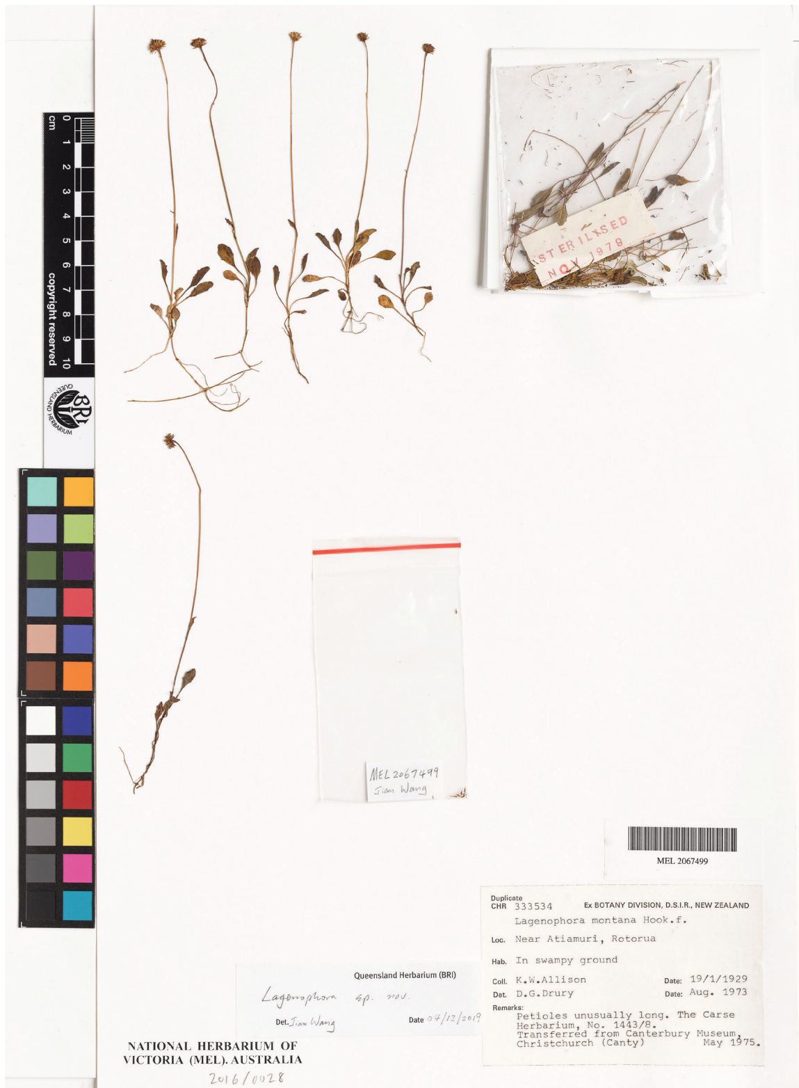
Fig. 1. Holotype of Lagenophora schmidiae de Lange & Jian Wang ter (MEL2067499). Reproduced with permission from the Royal Botanic Gardens Victoria