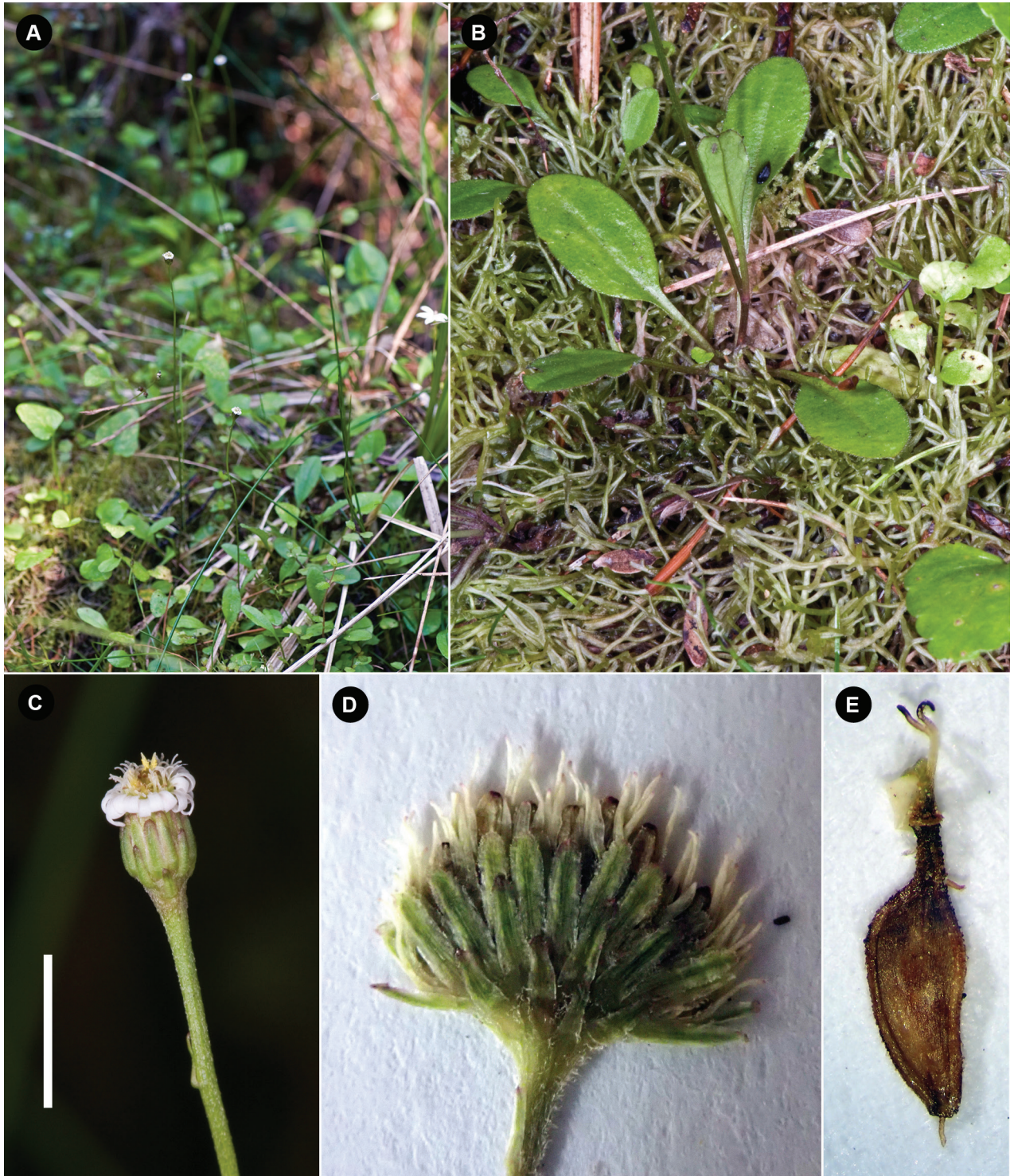
Fig. 2. Lagenophora schmidiae de Lange & Jian Wang ter. A: habitat of plants growing in damp, shaded ground within frost flat, Hauhungaroa Range, near upper Kuratau River bridge; B: L. schmidiae rosette and foliage, Hauhungaroa Range, near upper Kuratau River bridge; C: Mature capitulum, Hauhungaroa Range, near upper Kuratau River bridge; D: Capitulum (pressed specimen, P.J. de Lange 5746, AK284561), Hauhungaroa Range, near upper Kuratau River bridge; E: Achene (pressed specimen, P.J. de Lange 5746, AK284561), Hauhungaroa Range, near upper Kuratau River bridge