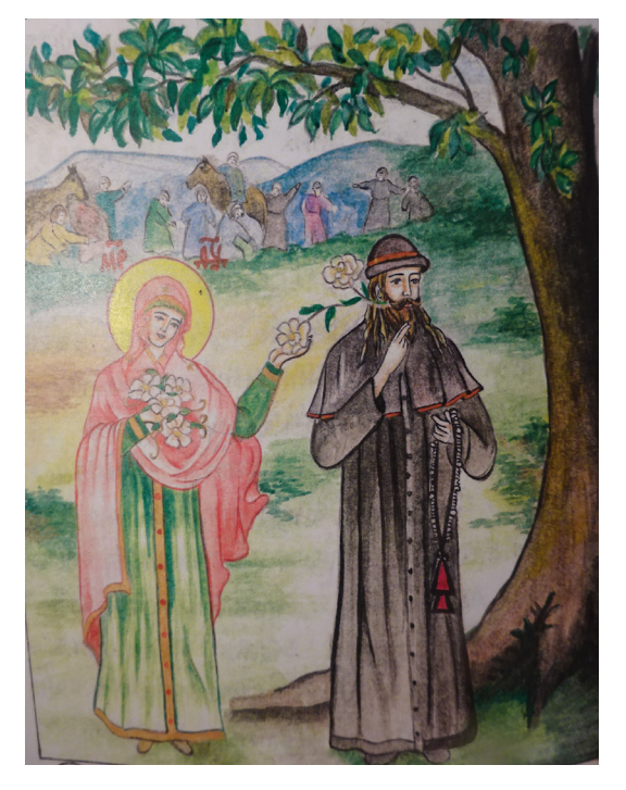
Illustration № 3 A monk praying with the Mother of God's lestovka (Old Believers' prayer ropes). The illustration of the book "The Miracles of the Most Holy Virgin".