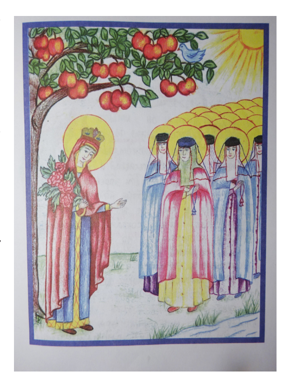
Illustration N^{o} 1 The image of the Mother of God meeting the holy nuns. leaders. However, an The illustration of the book "About the Kingdom of Heaven and the eternal punishment".

earthly monk was to be seen as an exemplar.