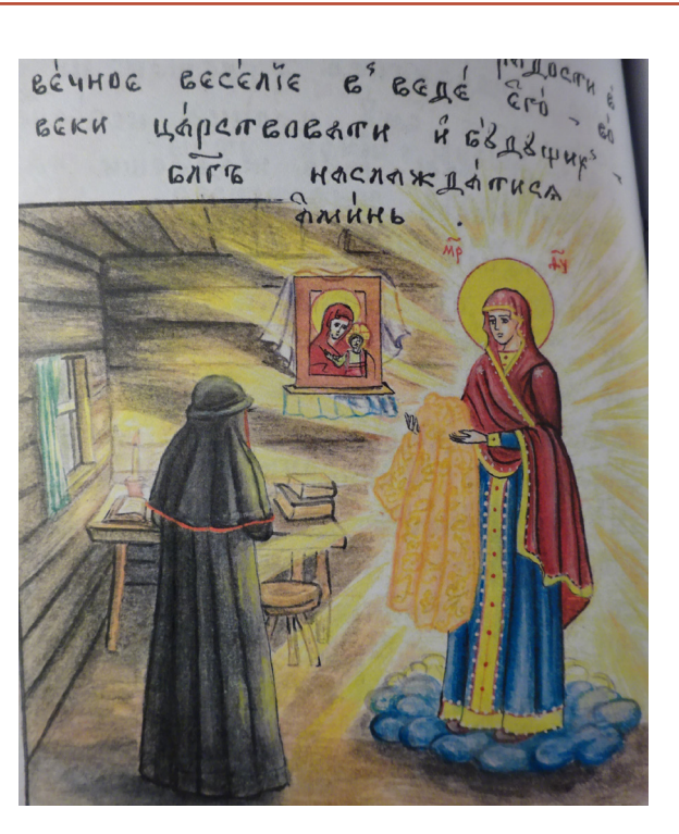
Illustration № 4 Monks' vision of the Mother of God in the cell. The illustration of the book "The Miracles of the Most Holy Virgin".

Besides the monk being seen as a cultural example, a truly believing layman is also represented as one, with the artist (particularly in the amply illustrated book "The Miracles of the Mother of God") portraying a layman wearing antique clothing in Byzantine or old Russian style. A number of paintings include elements of classic old Russian Orthodox garments (a skewed-collared shirt with a belt, a pinafore dress, a pinned headscarf) used by Old Believers as everyday, festive and, especially, praying clothes. Thus a historical true believer's image correlates to the image of a contemporary Christian, here, a follower of the Chasovennye accord of Old Believers.