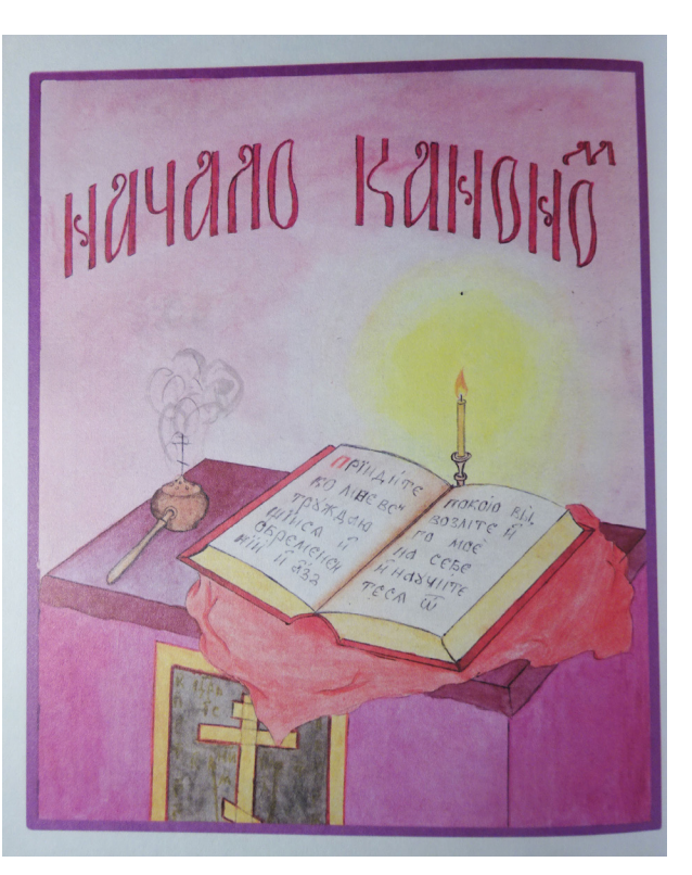
Illustration № 6. Old Believers' icon stand with a church book, a candle and a hand-censer. The illustration of the book "Hagiology of Saint Eustace Placidus the Martyr".

Chasovennye accord) or by presenting the contemporary view of the monastery that was cardinally rebuilt in the post-Schism time allowing innovations in architecture. Moreover, the processed photograph printed at the end of the brochure "A Poem of the Last Days" presents the image of a pregnant woman praying before the altar-screen in a large stone church. Obviously, this photograph was taken in one of the new churches and has nothing to do with the Chasovennye tradition, as is suggested by the interior of the monastery, garments, etc. This example makes it possible to state that in order to visualize particular passages in the text, photographs of newly built temples, rather than those of Old Believers' ones, can be used.