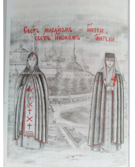
Illustration №2 Two nuns in the background of an old monastery. The illustration of the book "About Christian symbols".

Thus, in the book "On Christian symbols" published in 2017, page 224, figures of two nuns (one of which is holding a lestovka) in the background of an old monastery are supplied with a commentary "Monks are beacons for laymen, angels are beacons for monks".