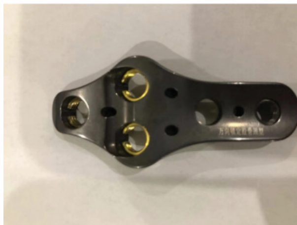
Fig. 1. The diagram of Targon locking plate.

Pain assessment was conducted using the visual analogue scale (VAS), a self-assessed questionnaire with a range of 0 to 10 points (11). The recovery of hip function was evaluated using the modified Harris hip score (MHHS),