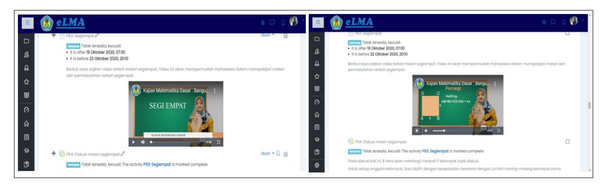
Figure 3. The integration of learning videos contained in the YouTube vlog channel into eLMA

When the learning videos contained in the YouTube vlog channel was integrated into eLMA, the results would be as show in Figure 3.