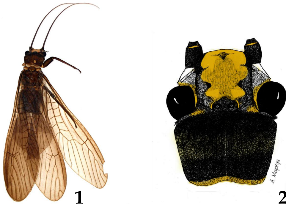
Figs. 1-2. Anacroneuria brava sp. nov. 1. Adult habitus. 2. Male head and pronotum.

Colección Nacional de Insectos (CNIN), Instituto de Biología, Universidad Nacional Autónoma de México (UNAM), Mexico City. Terminalia were clipped and cleared in 10% KOH using the procedures of Stark & Zúñiga (2003). An American Optical Company stereomicroscope was used to examine the specimens. Illustrations were hand drawn. Photographs of specimens were taken with an Auto-Montage system attached to a Zeiss Axio Zoom V16 stereomicroscope. Editing of the images was conducted using "Ipiccy", a free, online photo editor ( http://ipiccy.com/ ).