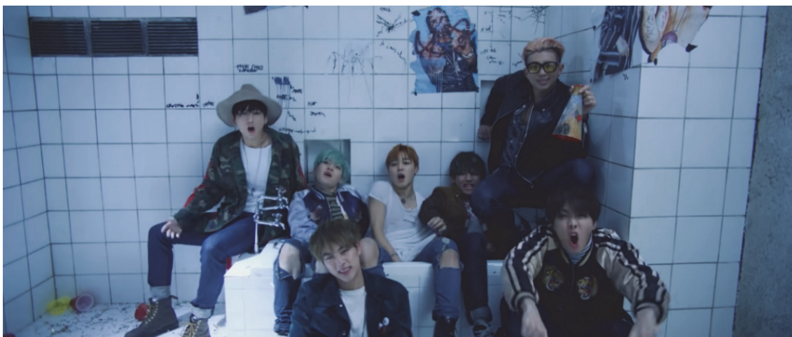
<Figure 2> Image of Friendship in BTS. (2015b). "Run" Official MV.

reach audiences and markets regardless of native language or culture.