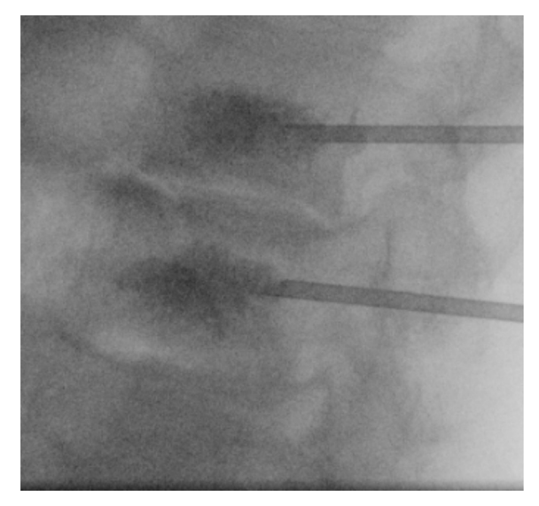
Figure 2. Lateral fluoroscopic image demonstrates vertebroplasty of vertebral bodies L2 and L3 using a left pedicular approach, 13 G cannulae and PMMA cement.

A fellowship-trained interventional musculoskeletal radiologist with over 20 years experience performed the procedure, using fluoroscopic guidance with the patient in the prone position. The skin was infiltrated with lignocaine 1%, and the periosteum with ropivicaine 10 mg ml<sup>-1</sup>. A left pedicular approach was used and a 13 G straight injection cannula was advanced to the anterior vertebral body of L2, and polymethyl methacrylate (PMMA) cement, consisting of 60% synthetic calcium sulphate and 40% hydroxyapatite, was injected. Once absence of leakage outside the vertebral body was confirmed, the cannula was withdrawn slightly, and further injections were performed in the mid and posterior vertebral body. The process was then repeated for the level below (Figure 2). Following the procedure, the patient remained prone for 20 min and was then rolled onto a bed, and instructed to lie motionless for the next 3 h. The patient was followed up each month for 3 months, and 6 monthly thereafter. He remains pain free approximately 3 years later.