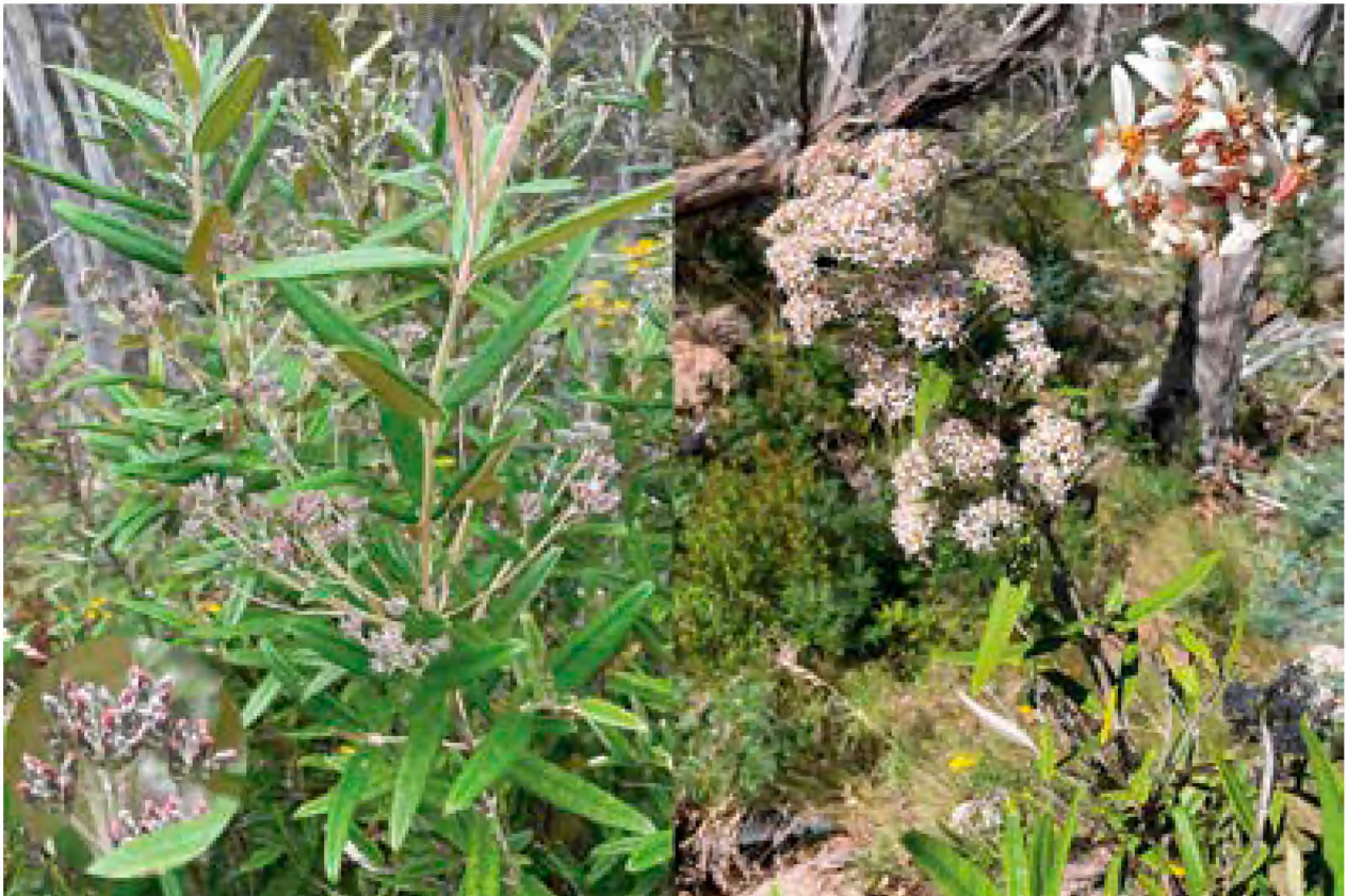
Figure 1. Mount Stradbroke population of Olearia aglossa in bud (left) and full bloom (right), inserts showing close up of capitula.

point remained unclear, with no other unambiguous specimens of this taxon held at MEL, and at least 140 years since its last sighting within the state.