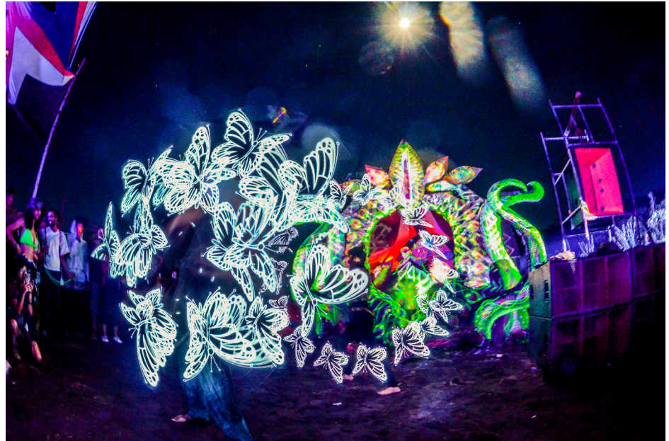
Figure 1. Equilibra performance group. Ressonar Festival, Chapada Diamantina (Brazil), 2020.

Here is a sample of Felipe Correia's photographs. You can see more of his work on his website .