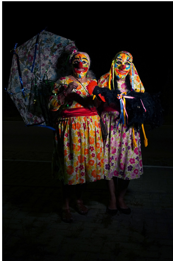
Figure 10. A Velha da Sombrinha e a Velha Do pássaro (The Umbrella Old Lady and the Bird Old Lady). Characters in the Reisado do Alto do Moura (popular festivity of the Brazilian Northeast), Caruaru (Brazil), 2023.