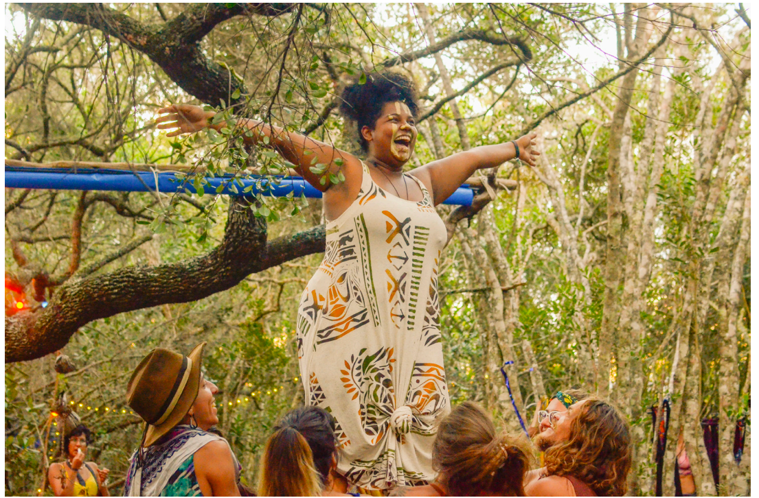
Figure 5. "Synesthesia." Clay interaction workshop. Ressonar Festival, Chapada Diamantina (Brazil), 2020.