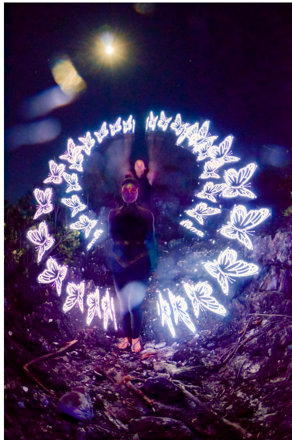
Figure 2. "The Portal." Equilibra performance group. Ressonar Festival, Chapada Diamantina (Brazil), 2020.