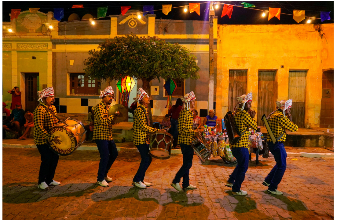
Figure 7. "Estrada do Festejo (Festive Road)," Banda de Pifanos Alvorada. São João Festivity, Caruaru (Brazil), 2022.