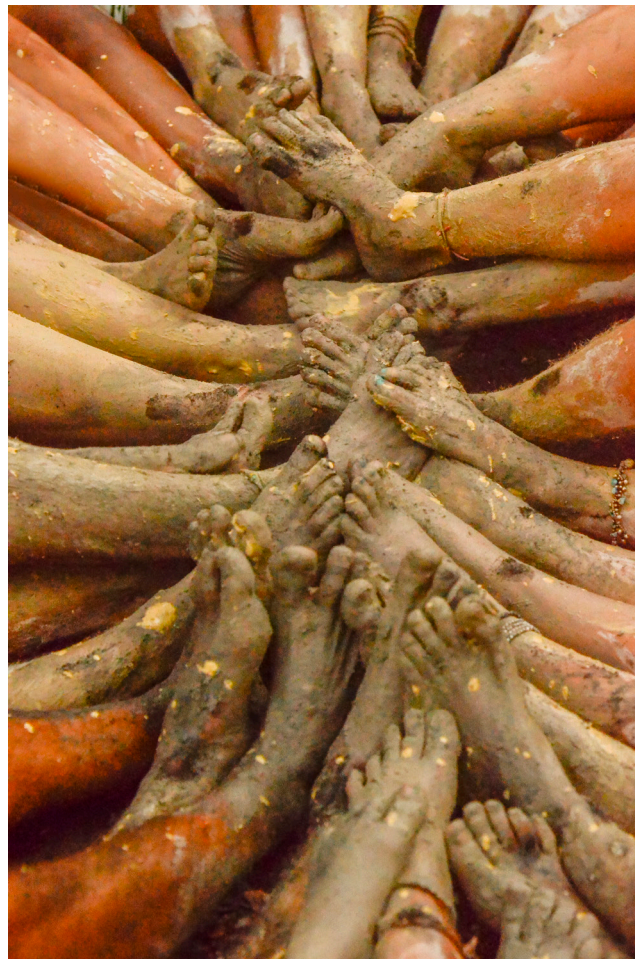
Figure 6. "Synesthesia." Clay interaction workshop. Ressonar Festival, Chapada Diamantina (Brazil), 2020.