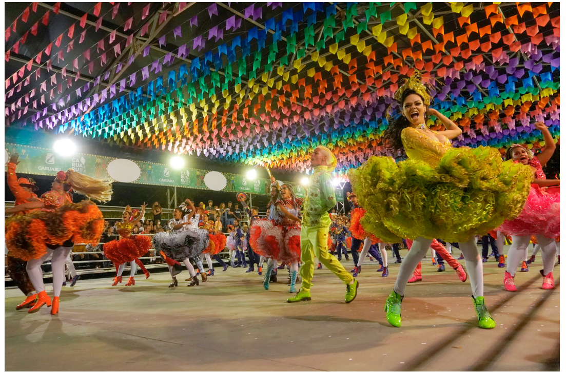
Figure 9. Stylized quadrilha dancing competition. São João Festivity, Caruaru (Brazil), 2022.