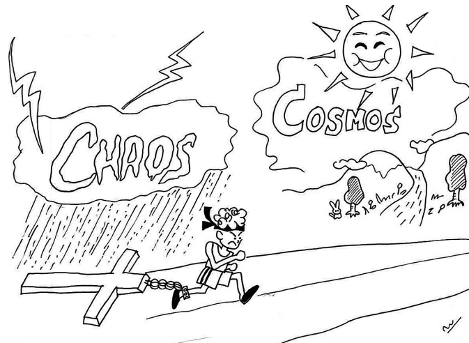
Fig. 2 An eternal burden of a human race. Humans are born to meet each mother, who is a guidepost for a trail tomorrow, where the human society awaits. The central dogma, ever kept running, is only one that God blessed. To live be a burden for all God's creatures encouraged either positively or negatively all along, and amplified by the society? Living in a remote and lonely island, the PPD suffered wouldn't be aware of her nuisance, so much so that the PPD must be a social "Morbus". Drawn by Miss Fukunaga, M., 1988.