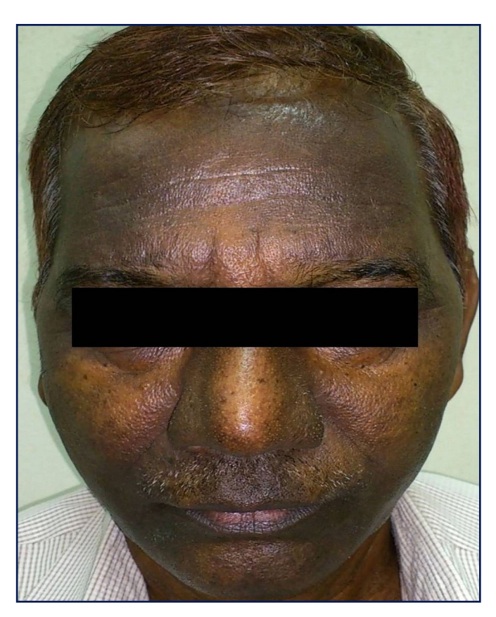
Figure 2 Pigmented cosmetic dermatitis of face predominately involving forehead, beard and moustache areas following regular use of hair color.

Periorbital hypermelanosis is frequent in women, in early adulthood (mean age 21 Years) and factors like genetic/constitutional (in 77%), atopy (in 33%), refractive errors (in 30%), stress and inadequate/abnormal sleep pattern (in 40%), anemia, periorbital edema and skin laxity were implicated factors in a study. Similarly, the periorbital hypermelanosis was second most common and noted in 32 (10.7%) patients aged between 18 and 45 (mean 28.77) years (Fig. 3). Conformingly, family history of periorbital melanosis in 7 (21.8%) patients and personal or family history of atopy in 5(15.6%) patients was noted. In addition,