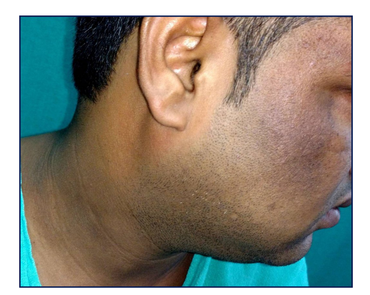
Figure 4 Acanthosis nigricans: characteristic velvety hyperpigmentation involving neck fold and malar skin.

are also hyperpigmented macules and unlike photo-distributed freckles, they may appear at any site with tendency to persist. Genetic and constitutional factors are implicated etiological factors. Freckles and lentigines are another significant cause of facial hypermlanosis and social embarrassment and were noted in our 26 (8.7%) patients with Fitzpatrick skin type III-IV aged between 19 and 46 (mean 26.4) years. Three (11.5%) patients also had another affected family member. While 20 (76.9%) patients had frequent sun exposure, only 8 (30.8%) patients were using OTC sunscreens suggesting little concern these cause among non white skin individuals.