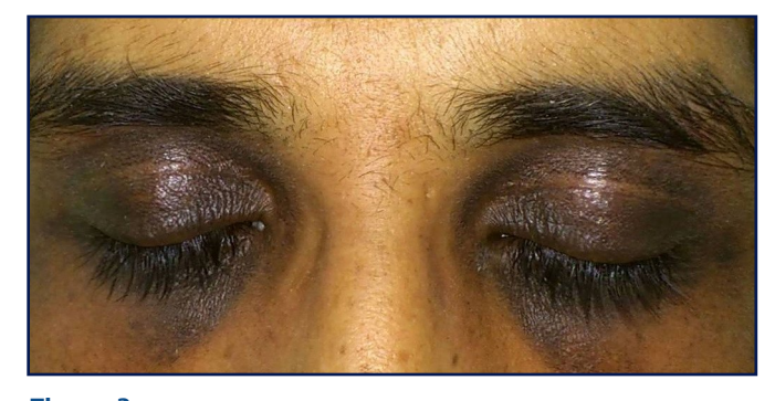
Figure 3 Non-familial periocular hypermelanosis in a non-atopic 25-year-old male.