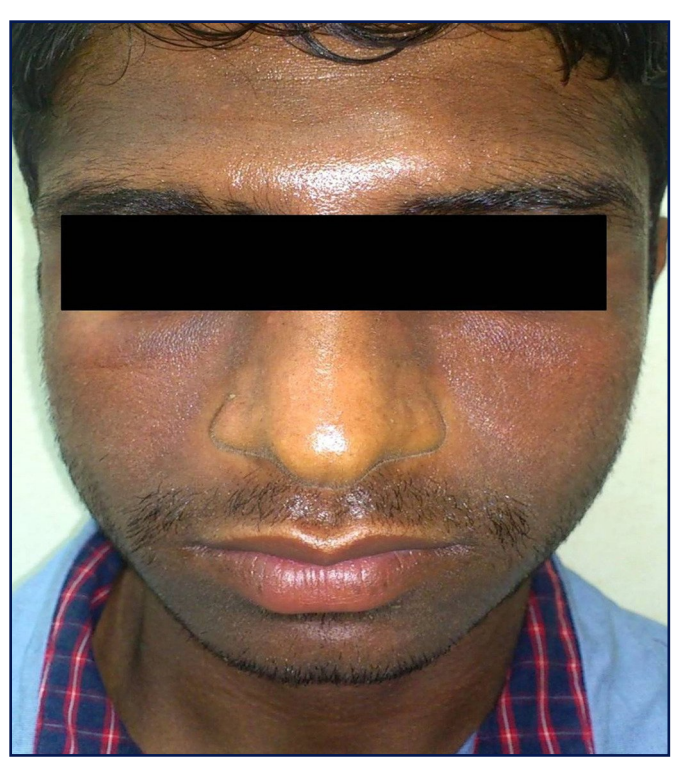
Figure 5 Lichen planus pigmentosus involving neck and whole face sparing nose.

cal application of mustard oil/ amla oil could not be excluded however. Nevus of Ota (6 patients, Fig. 6), ashy dermatosis (1 patient), Becker's nevus (1 patient) and erythromelanosis follicularis of face and neck (1 patient) were other less commonly observed dermatoses.