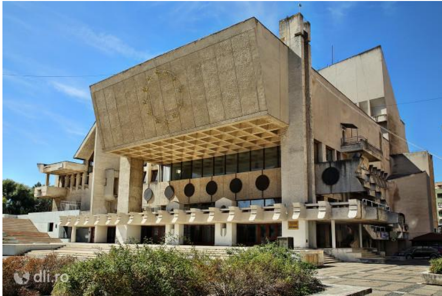
Fig. 2. Searching for "identity" in architecture in post-war Romania, during the socialist-communist period: arch. Nicolae Porumbescu and the so-called "House of Culture" in Satu Mare. One can notice the formal references to wooden folk architecture, such as the suggestion (in brickwork and concrete) of typical wooden "dovetail" notches and joints. The references to the traditional Romanian architecture are more complex and varied, but the "dovetail" is one of the most noticeable "quotes" from this type of architectural language.