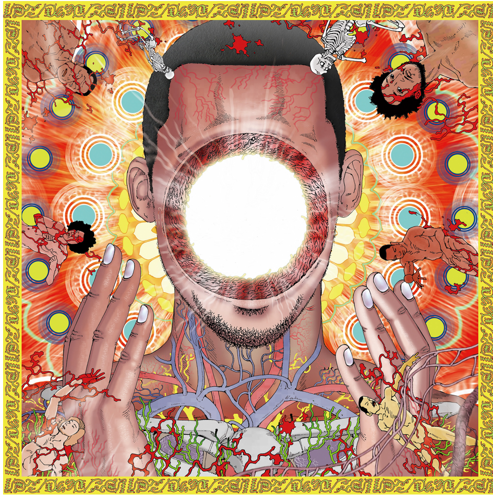
FIGURE 5. FLYING LOTUS, YOU'RE DEAD (2014). FRONT COVER ILLUSTRATION BY SHINTARO KAGO.

You're Dead! is part of a series of Flying Lotus' meditations on death. Until the Quiet Comes (2012) was a tribute to Ellison's friend, Austin Peralta, the promising young jazz pianist who overdosed and died at 22. You're Dead! 's " The Boys Who Died in Their Sleep " is also dedicated to Peralta, and it references lost performers like J. Dilla and Freddie Mercury whose early, prog-inflected Queen records proved an instrumental counterpoint to the project's hard bop-inspired jazz fusion (Roberts 2014). Flamagra (2019), with contributions from an even larger roster of recognizable guest voices, can be heard as a reflection on climate death. You're Dead! is the Bardo album. Here, Flying Lotus narrates his own liminal encounter with mortality within a vast psychedelic mind-machine musical system. Lo-fi becomes a psychic defense strategy, with high levels of compression and distortion degenerating his source material into something raw, fragmented, digital and fucked up. Lo-fi conditions are provocative in schizophonic sound systems. They were particularly problematic for