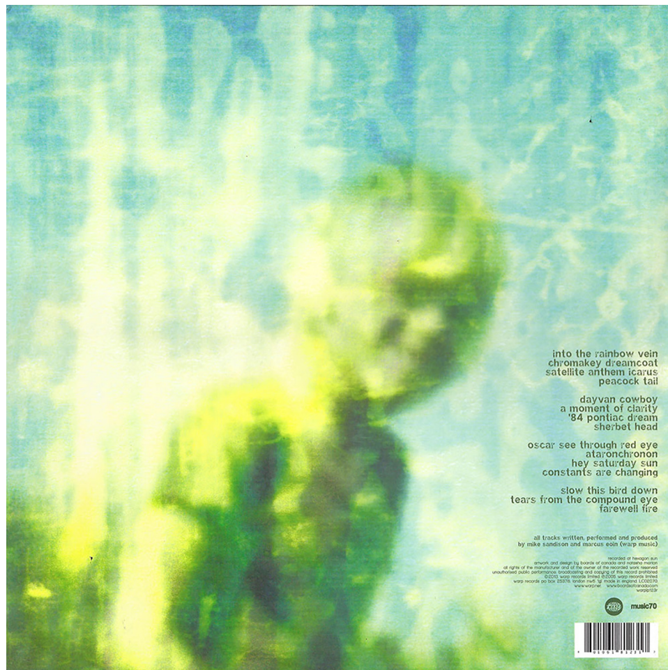
FIGURE 3. BACK COVER OF BOARDS OF CANADA, THE CAMPFIRE HEADPHASE (2005).

In a circumvention of Reynolds' sampladelia, which involves the extraction of samples from actual 1960s and 1970s recordings, Boards of Canada tracks often only seem to come from earlier media. The melodic loops of instruments and fragments of voices cannot be detangled from the way they sound, which typically suggests a warped, flanging, flawed recording and playback medium. Boards of Canada's album art features images that are prismatic, overly saturated, with photos of families and children, faces erased or blurred, artificially aged to reveal weird auras and visual artifacts (fig. 3).