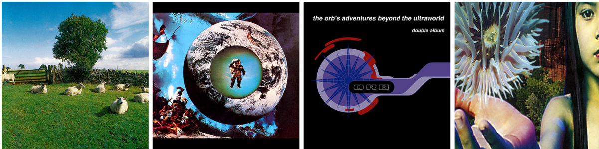
FIGURE 2. FOUR YEARS OF AMBIENT HOUSE:

that captured this sound: The KLF's Chill Out and Jimmy Cauty's Space , both from 1990; The Orb's 1991 album, The Orb's Adventures Beyond the Ultraworld (1991); and 1994's Lifeworlds , by The Future Sound of London (see fig. 2).