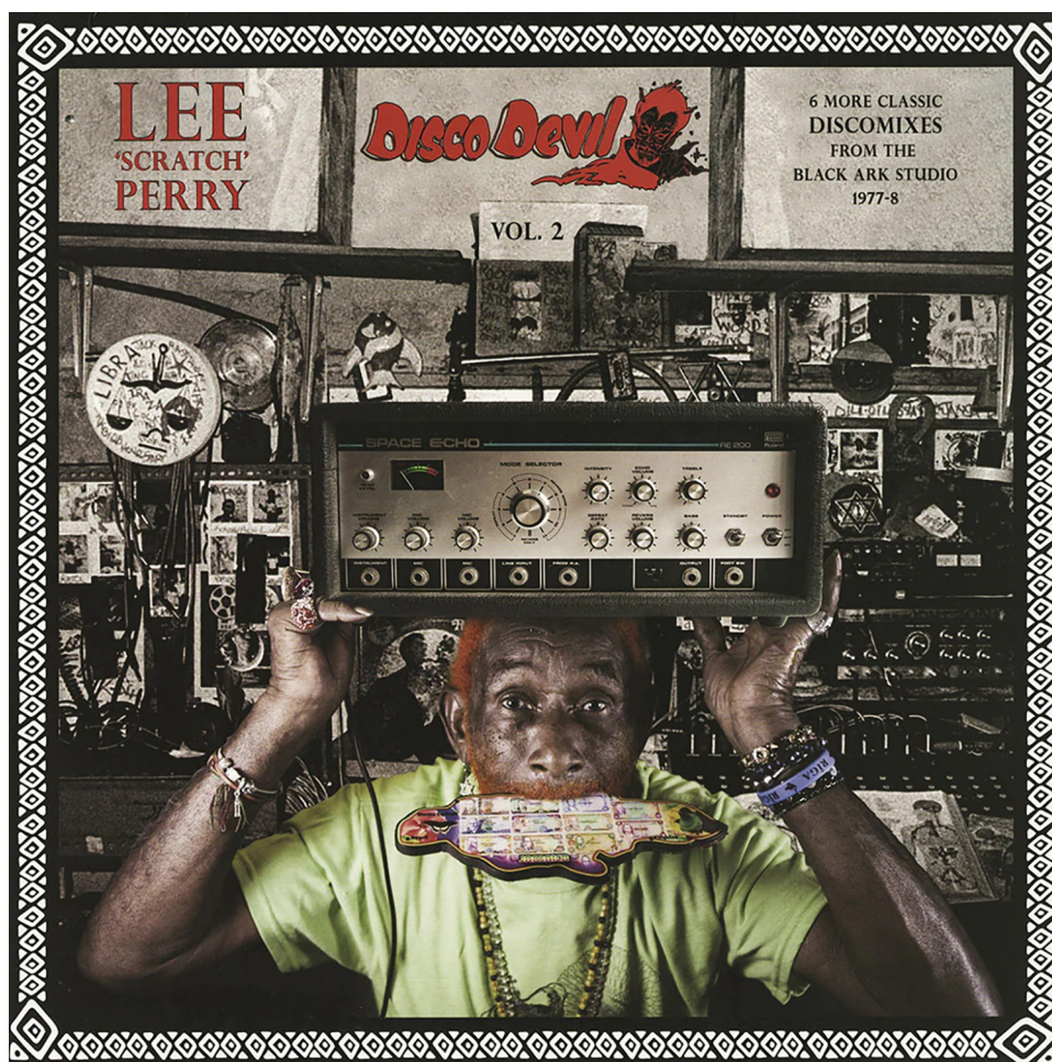
FIGURE 1. LEE “SCRATCH” PERRY AND ROLAND SPACE ECHO. DISCO DEVIL VOL. 2 (2019).

I put my mind into the machine and the machine performs reality. Invisible thoughtwaves, you put them into the machine by sending them through the controls and the knobs or you jack it into the jackpanel. . . . The jackpanel is like the brain itself so you got to patch up the brain and make the brain a living man. (Eshun 1998: 62–3)