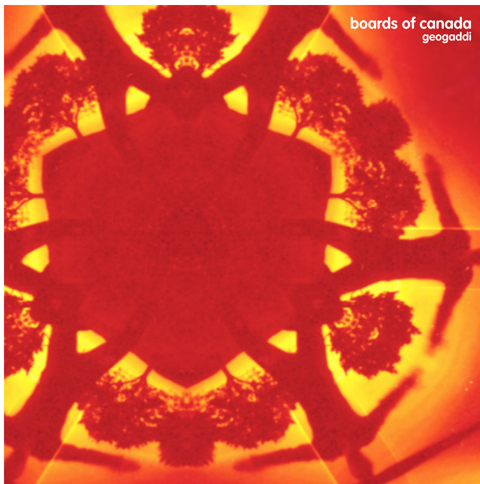
FIGURE 4. BOARDS OF CANADA, GEOGADDI (2002). FRONT COVER PHOTO BY PETER IAIN CAMPBELL.

Geogaddi continually pulls the ear deeper into the sensorium, making us listen more deeply, attend to hidden details, listen to ourselves listening. Sound paisleys form here through this reiterative action, complex, fractal scaffolds of musical affordances that spiral into each other (fig. 4).