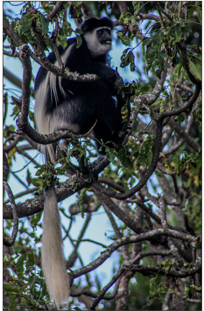
Figure 2. Adult male Mount Kenya guereza Colobus guereza kikuyuensis , Nanyuki, central Kenya. In this subspecies, 71–81% of the tail is white.

Primate surveys were conducted 27–28 September 2014 from a vehicle and on foot by the two authors. Transects were run along dirt roads and foot paths. These were selected to maximize the chances of encountering as many individuals of as many species of primate as possible. As time was very limited, the rapid assessment survey method was used, as described in Butynski and Koster (1994), White and Edwards (2000), and Butynski and De Jong (2012).