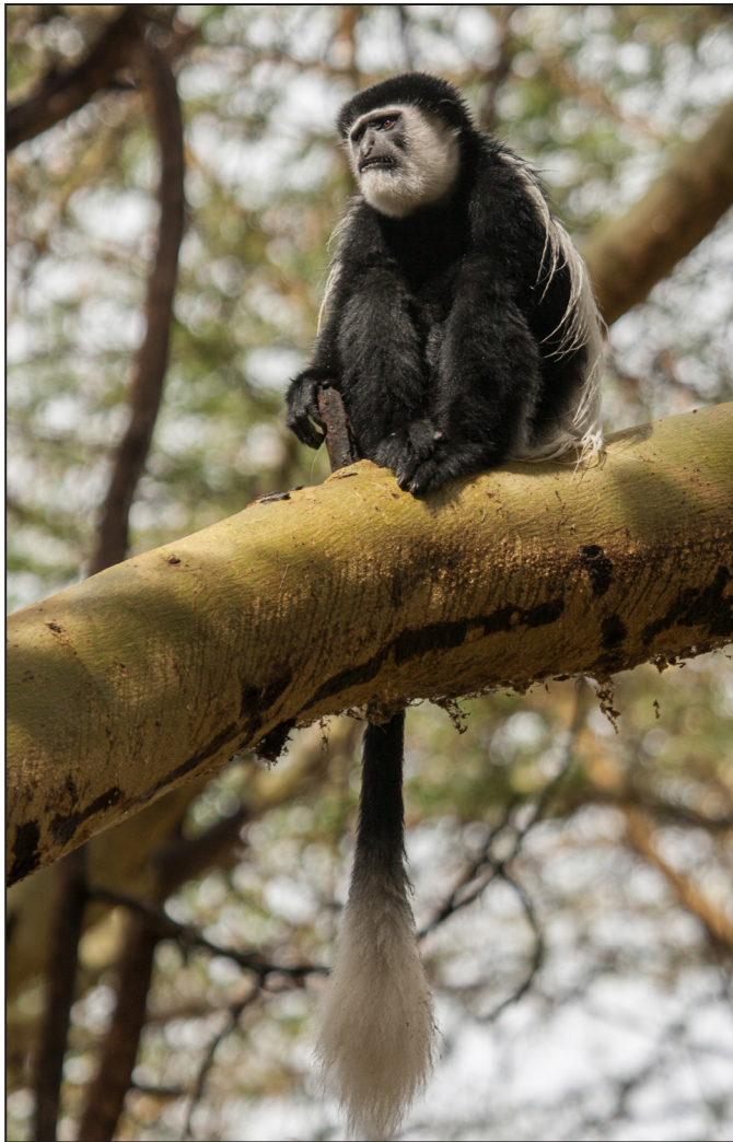
Figure 1. Adult male Mau Forest guereza Colobus guereza matschiei , Lake Naivasha, southwest Kenya. In this subspecies, 36–57% of the tail is white.