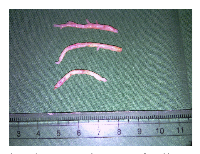
Fig. 4 - Three coronary endarterectomy performed in a 39-year-old on beating heart.

OPCAB like any other major surgery produces hypercoagulable state which may affect graft patency. In ONCAB, cardio-pulmonary bypass induced coagulopathy provides some protection against graft thrombosis. The trials showing inferior graft patency after OPCAB may have resulted from any