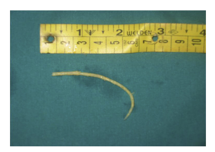
Fig. 1 – Atheroma removed from LAD during OPCAB.

surgeons in our part of the world. Present Prime Minister of India underwent redo CABG using off-pump technique (first CABG was done outside India several years back.) This proves a point in favor of the advanced level of refinement of the OPCAB technique in our country.