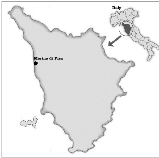
Figure 1: Study area near Marina di Pisa in Italy where the Barn Owl pellets were collected

Slika 1: Obravnavano območje blizu kraja Marina di Pisa (Italija), kjer so bili nabrani izbljувki pegaste sove