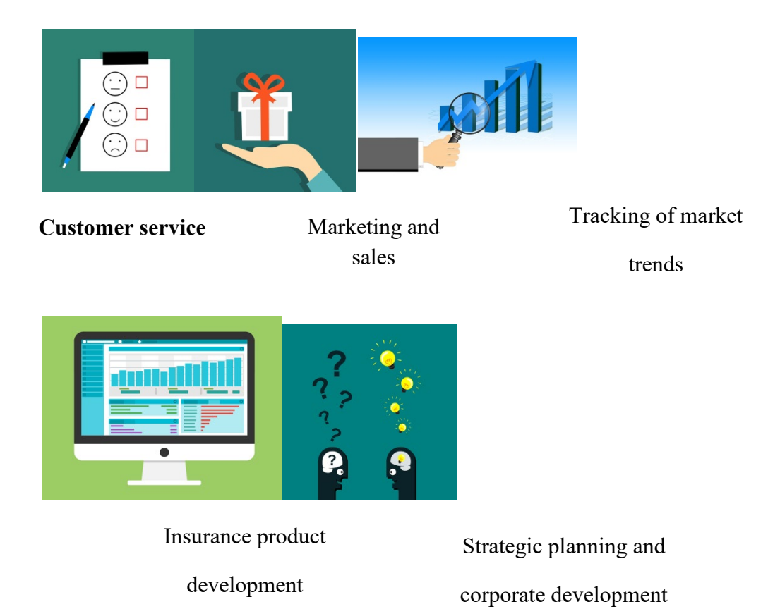
Figure 1. Areas of data use in the insurance industry.

These data also plays a vital role in helping insurance companies in various ways as shown in figure 2: