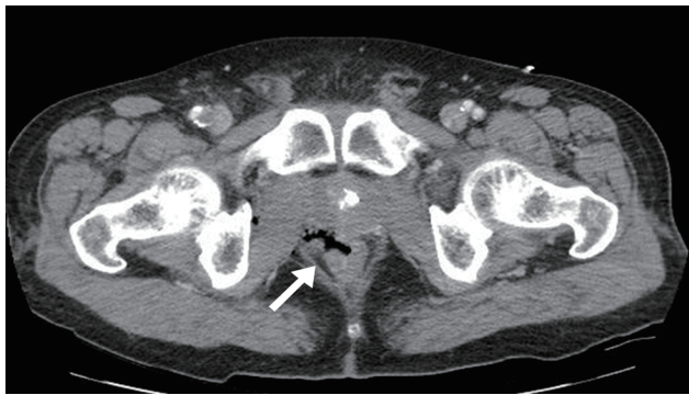
Fig. 1. Abdominal computed tomography showing a rectal wall defect and air density in the perirectal space (arrow).

Atypical hemolytic uremic syndrome (aHUS) is a rare, progressive, life-threatening condition of thrombotic microangiopathy (TMA). This disease is characterized by an abrupt or gradual onset of thrombocytopenia, microangiopathic hemolytic anemia (MAHA), and renal impair-