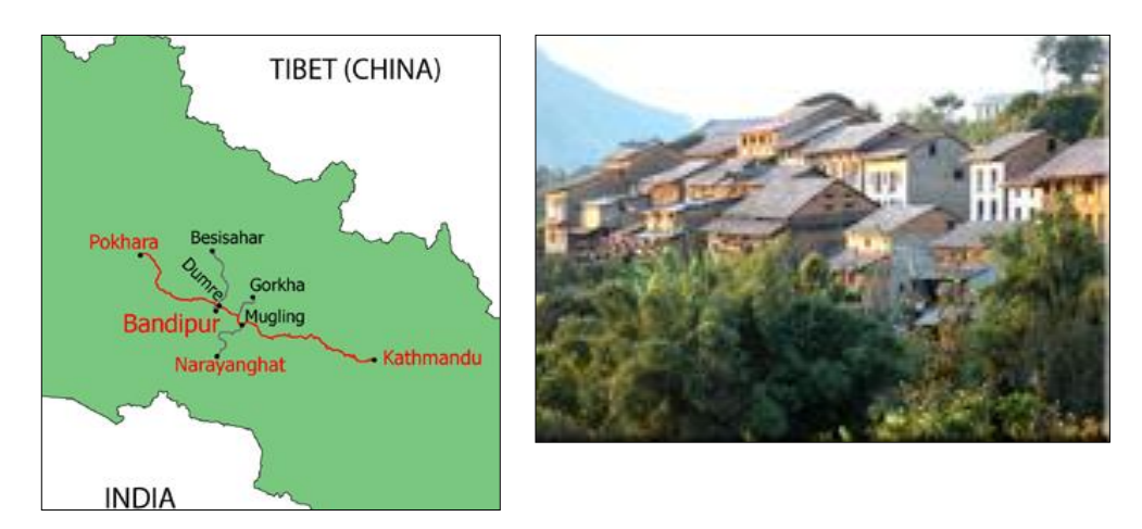
Figure 6. Bandipur location and image , Source : [1]

The BECT project focused on development of Bandipur as an eco-cultural tourist spot that is sustainable . The 2 years (2005-2006) project emphasizes the importance of interaction and discussion with the project partners and the local community. In contrast to the BDP, the project is of a small scale and focusing on only one aspect of urban renewal i.e. tourism promotion. May be due to which intensive public participation and discussions could be carried out. The activities of the project are broadly categorised into conservation, tourism, trainings, publication and promotion.