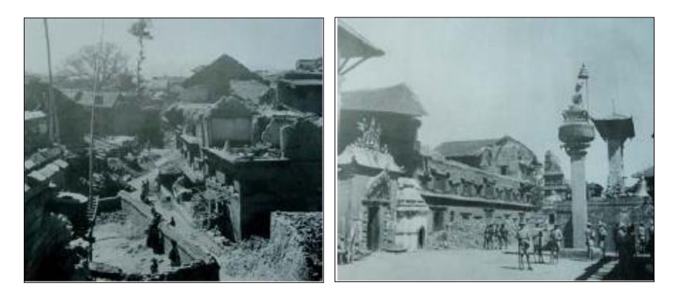
Figure 2. The palace and temples in ruin (L) and residential buildings destroyed (R) in 1934 earthquake

In the year 1970, the Federal Republic of Germany presented a gift of Deutsche Mark (DM) 100,000 to the then Crown Prince, His Majesty Birendra Bir Bikram Shah Dev on occasion of the wedding. The gift was to be used for the restoration of a historic building. The Pujari Math in Bhaktapur was identified for restoration and was restored by a group of German architects in 1971/72. Thereafter, a proposal was prepared for integrated urban renewal by the appraisal group for the Federal Ministry of Economic Cooperation. It started the technical cooperation between the governments of Nepal and Germany .