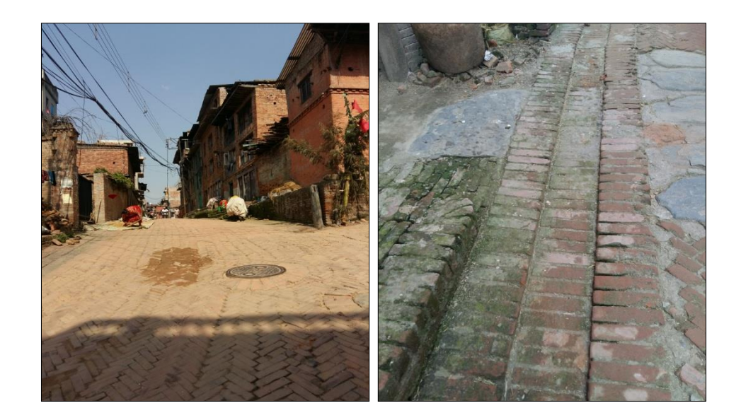
Figure 4. Street and brick paved drain in Bhaktapur in 2017, Source: The Author