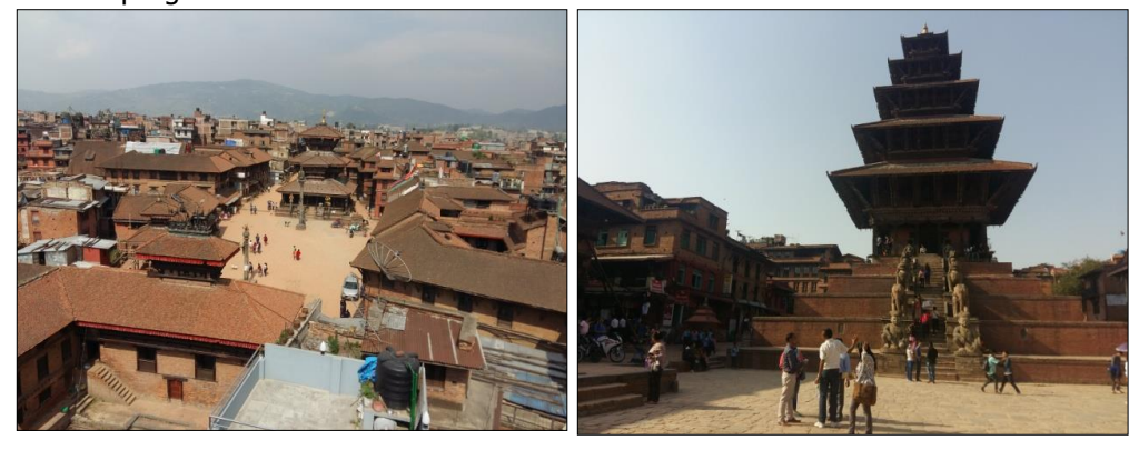
Figure 3. Dattatreya Square (L) and Taumadhi Square in 2017

It has to be noted that parallel planning and implementation strategy has been a successful tool for achieving results sooner. But it left no time to take in public ideas for the project. The strategy resulted in huge time pressure, ad-hoc decisions and unsystematic working procedures. However, the improvement in environment in the northeast quarter of Bhaktapur was appreciated by the population. In addition, the simultaneous experience in the field resulted in development of realistic programmes.