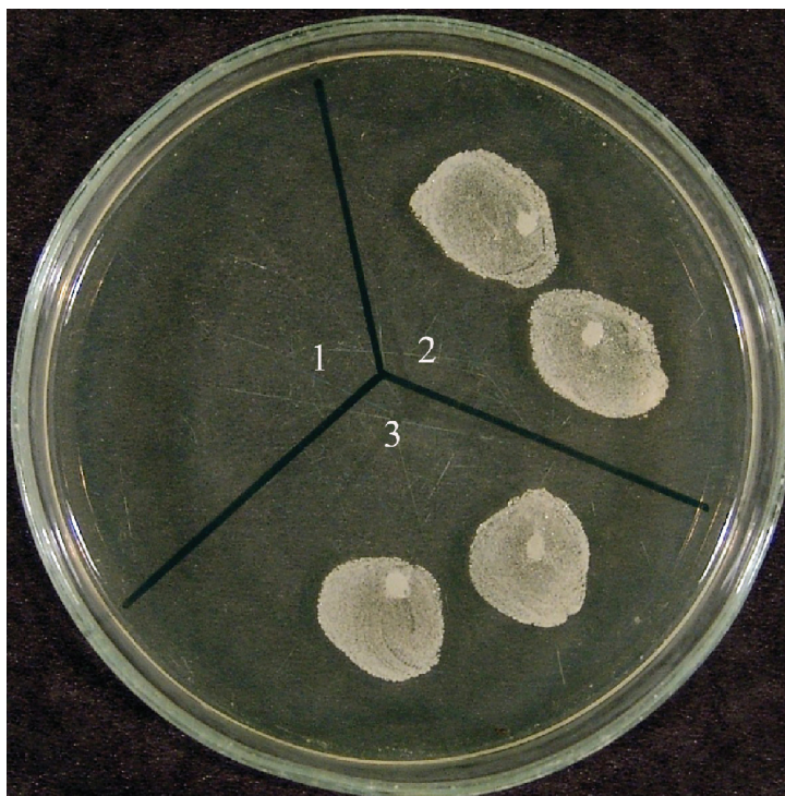
Figure 2. Staphylococcus aureus strains sensitive to oxacillin (1) and resistant to oxacillin (2 and 3) by the agar screening method (Mueller-Hinton agar containing 6 µg/mL oxacillin + 4% NaCl).

PCR revealed the presence of the mecA gene in 18 (18%) isolates. Eleven of these isolates were