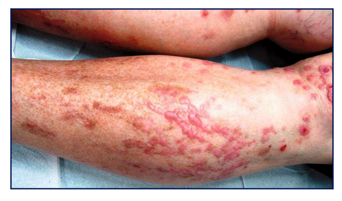
Figure 1 Bullae located on violaceus papules on the legs.

On the other hand, there is a report of BLP developing in the skin graft donor site of a psoriatic patient.<sup>13</sup>