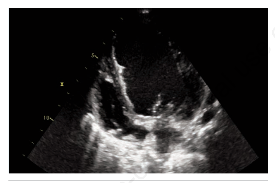
Figure 2. Severe aortic stenosis showed in apical 4-chamber view.