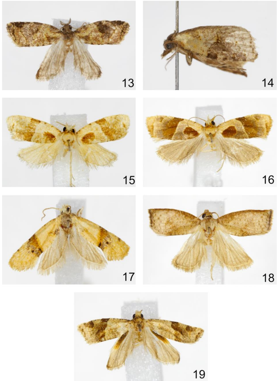
Figs 13-19. Adults: 13 – Sagittantrastilla oios sp. n., holotype, 14 – Teapeulia banhadana sp. n., holotype, 15 – T. sepulturae sp. n., holotype, 16 – T. sepulturae sp. n., paratype, 17 – T. albicota sp. n., holotype, 18 – Thypsaenia psauenythia sp. n., holotype, 19 – Proathorybia zonalis RAZOWSKI & BECKER, 2000, Chapada, Linares, Brazil.