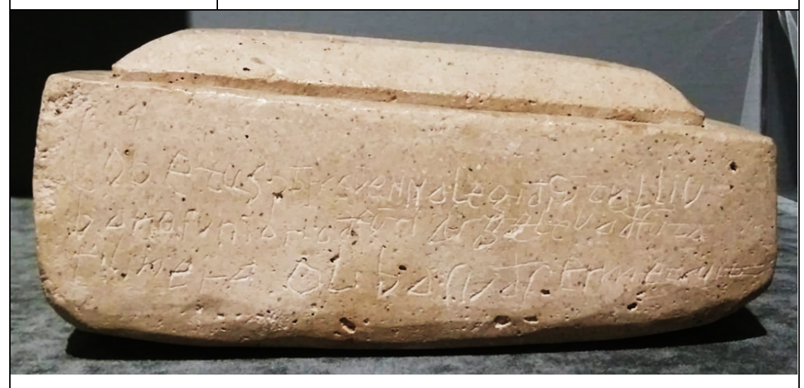
Fig. 6