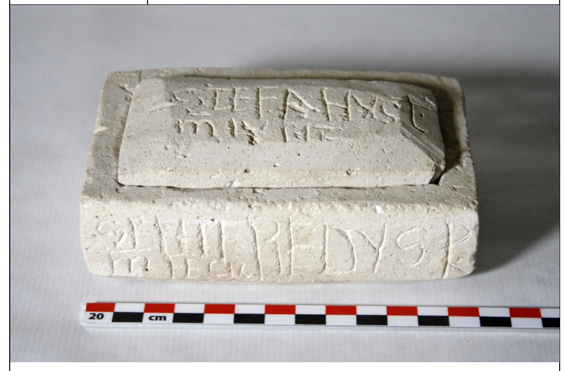
Fig. 4