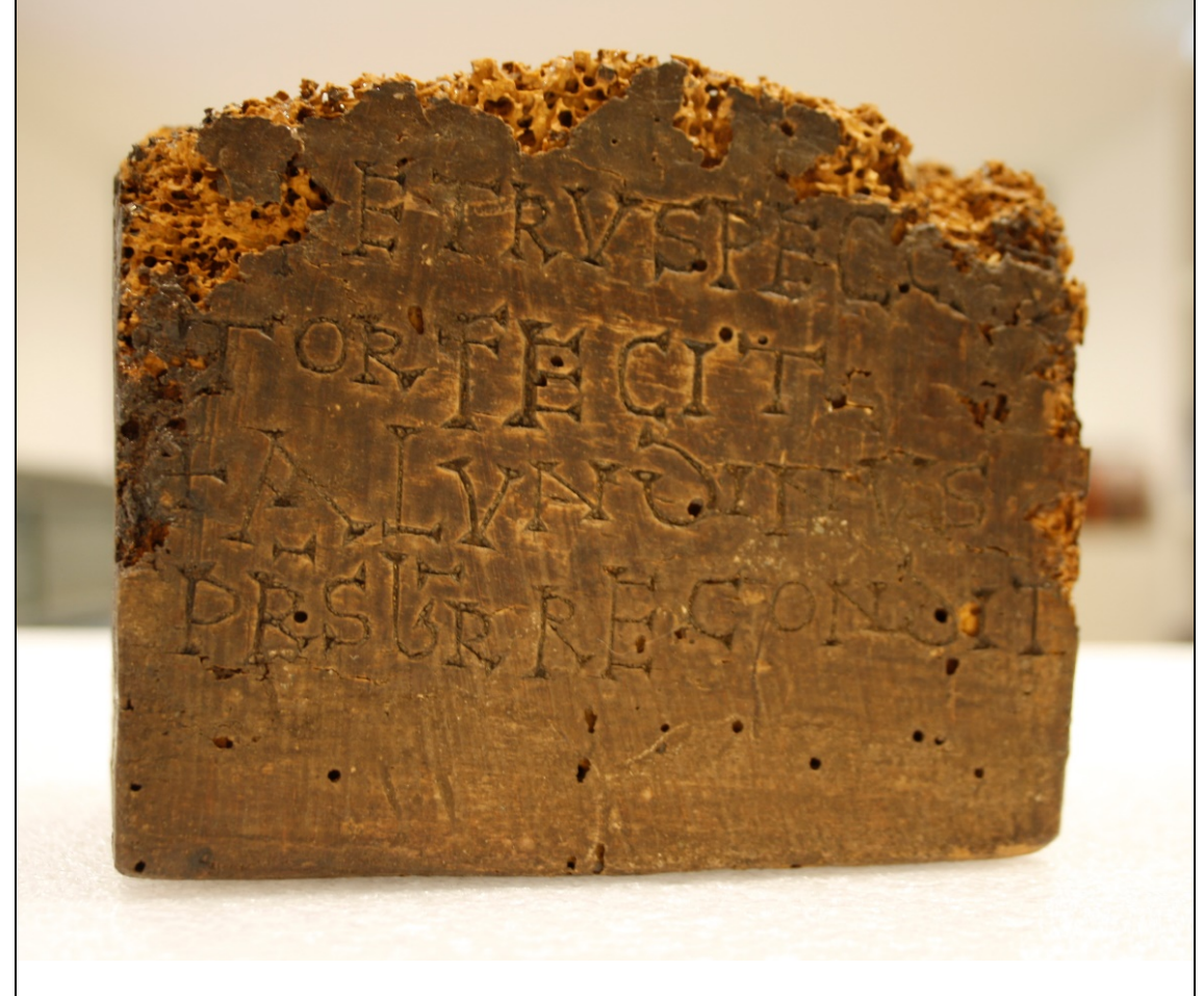
Fig. 5 (Picture by Author © Patrimoni Cultural d'Andorra)