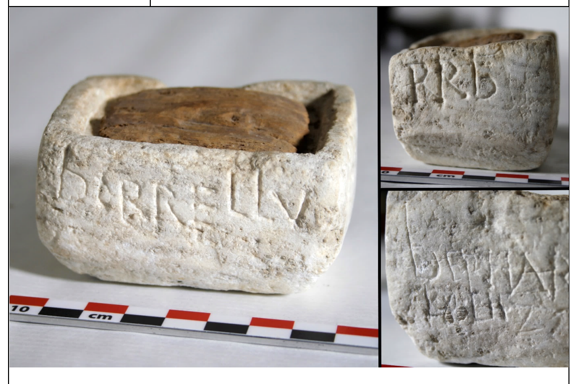
Fig. 1