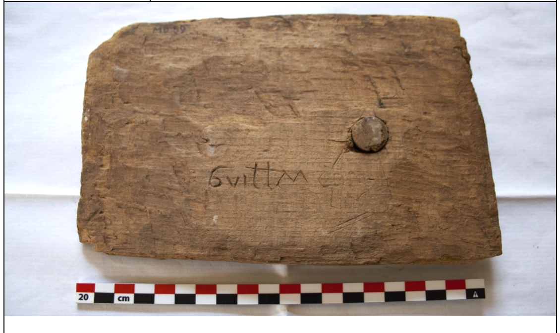
Fig. 2