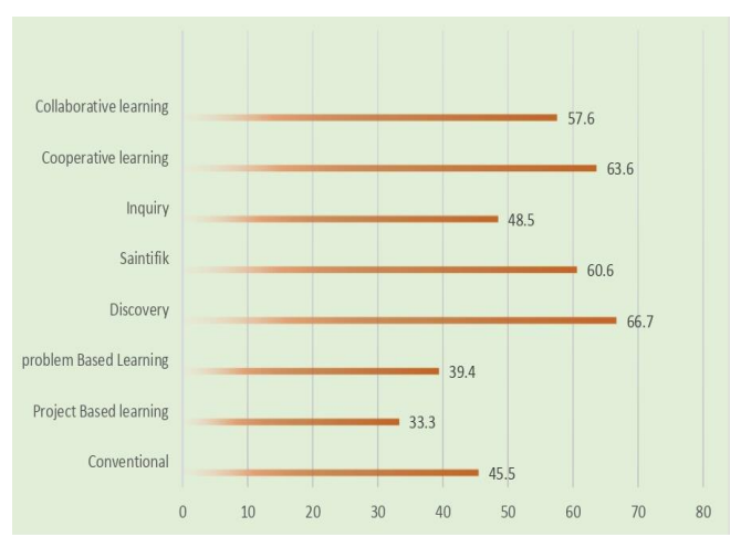
Figure 2 The Approach or Method Used in Learning to Speak

Based on Figure I, it shows that speaking skills can be learned through various genres of text. The text genres that most teachers choose are argumentative text types (debate, negotiation, criticism and essays), literary text types (drama, poetry, saga), and other types of text (observation reports, procedures, lectures).