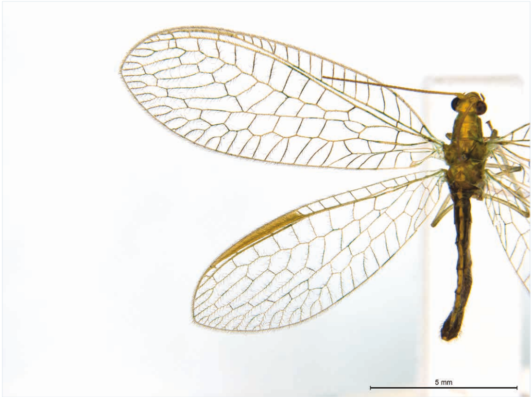
Figure 2. Mallada basalis male.