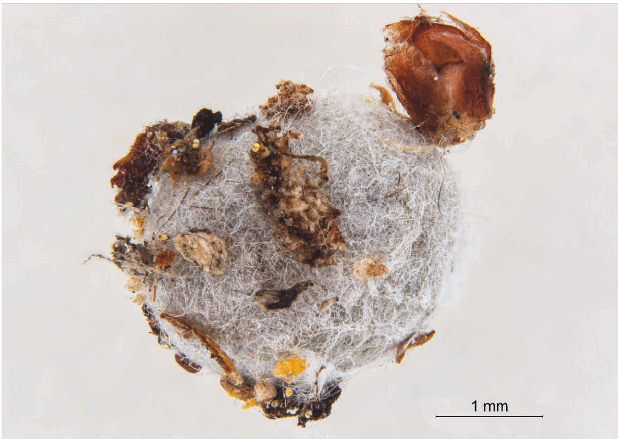
Figure 5. Mallada basalis cocoon.