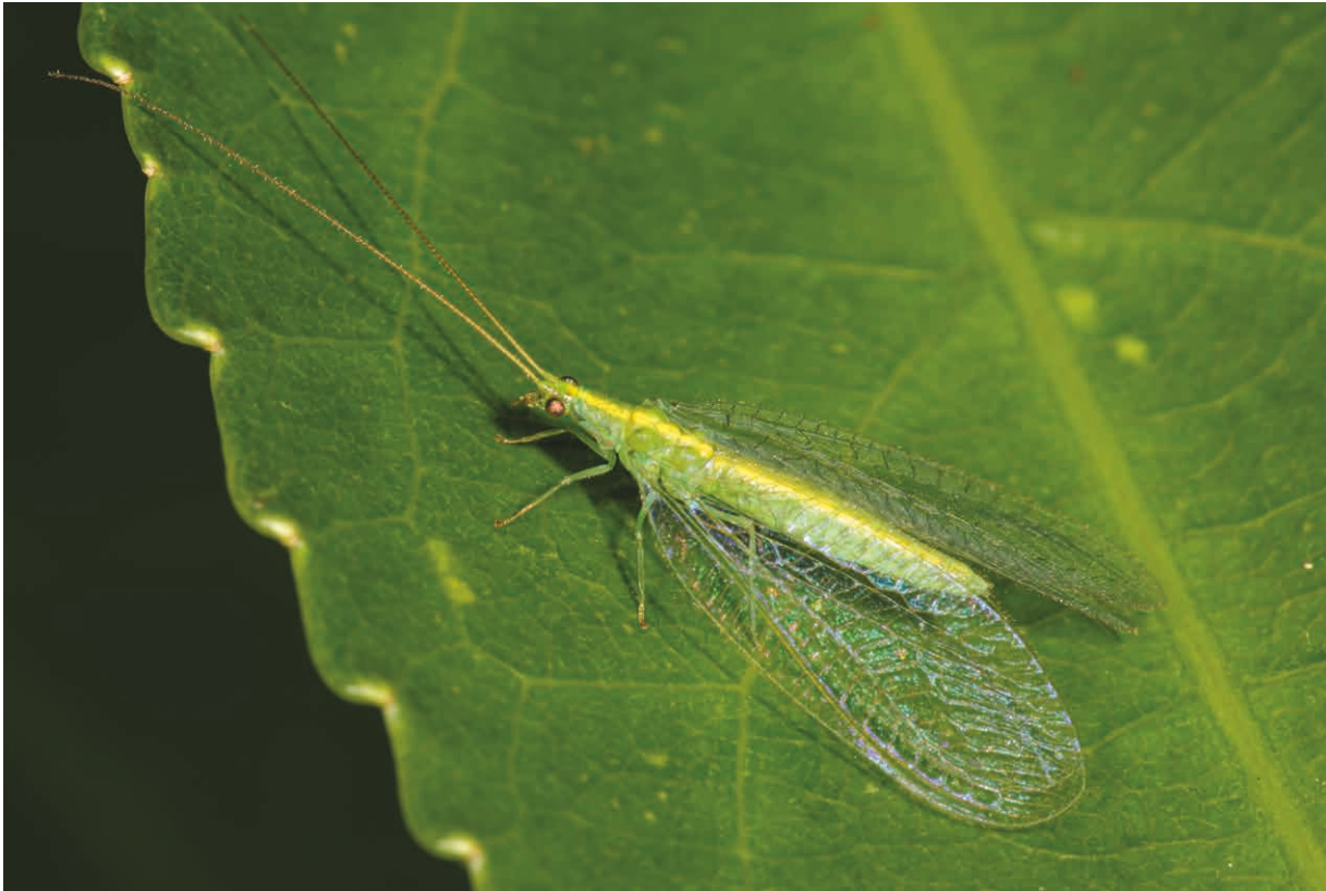
Figure 1. Mallada basalis female, Tiritiri Matangi, May 2016.

Males are readily distinguished by the presence of a strong green pterostigma on the hind wing (Fig. 2). In the female the pterostigma may be absent or pale brown but never as strong as in the male (Fig. 3). New (1980) provided illustrations of the apex of the abdomen which also help identification of the sexes.