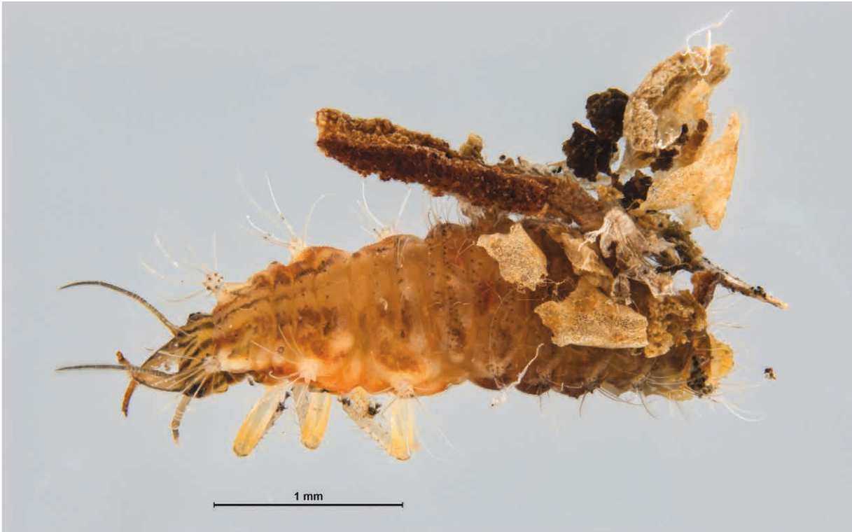
Figure 4. Mallada basalis larva.