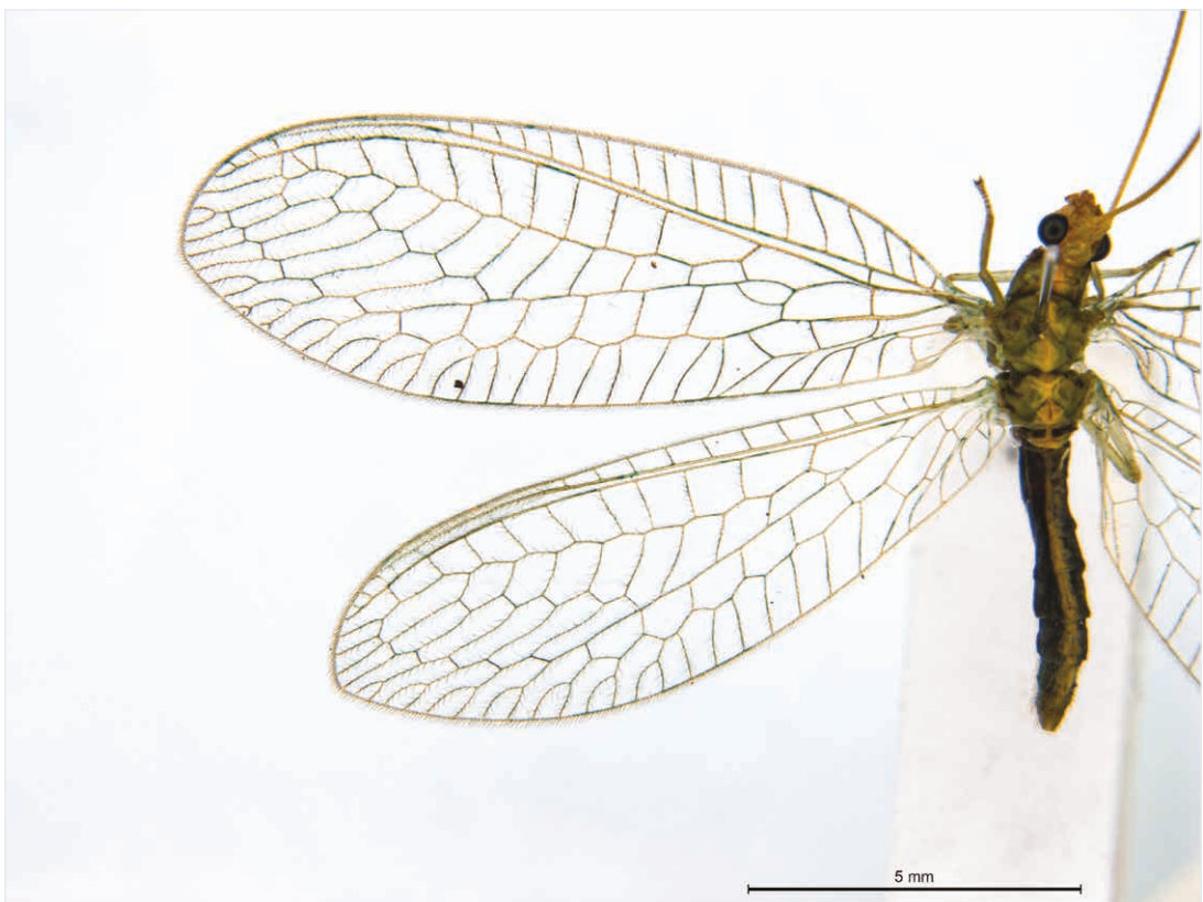
Figure 3. Mallada basalis female.