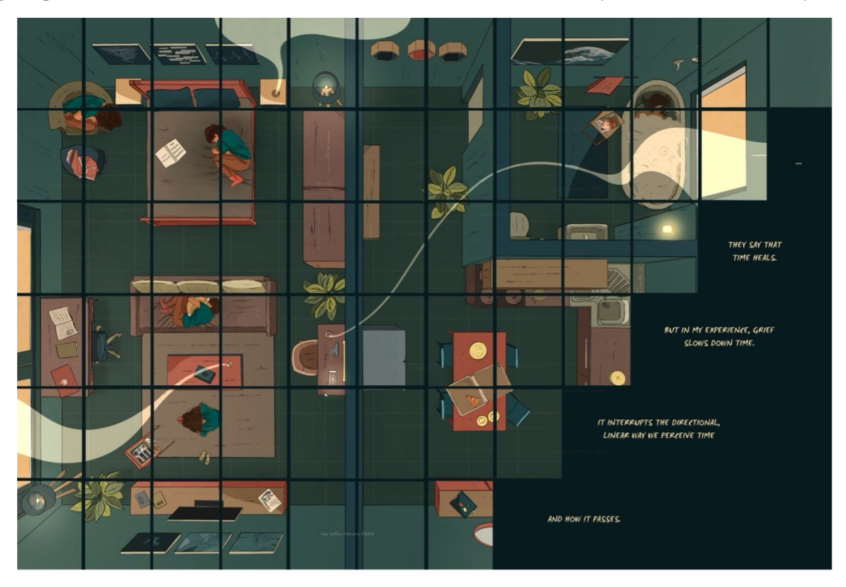
Figure 5 Pages from Drawing Unbelonging, ©Kay Sohini.

infliction" (Sohini). As I do in Queen of Snails , Sohini looks at transgenerational issues that affect mental health, as well as socio-environmental factors that should be considered. This unflattening of the besieged self is a self-compassionate reclamation, an insistence that the narrating "I" not be reduced to an easily legible persona, but that she instead be allowed to unfold multidirectionally and multidimensionally.