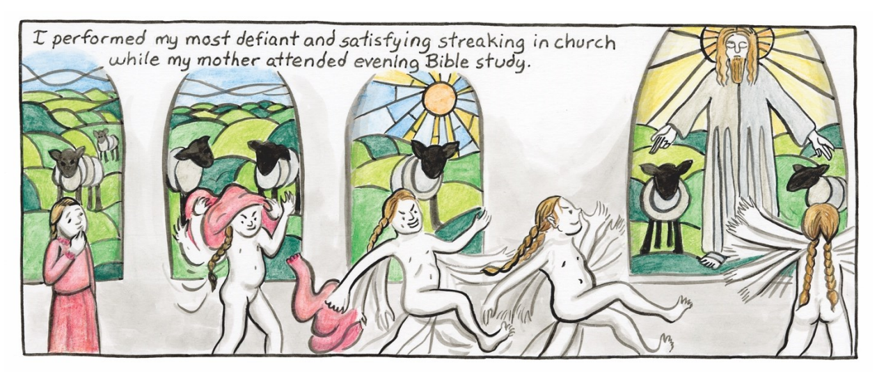
Figure 2 Panel from Queen of Snails, p. 110