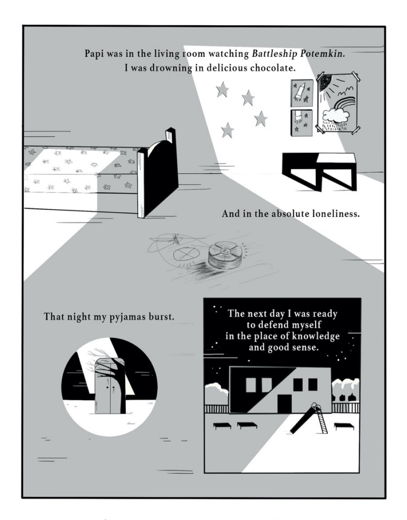
Figure 3 Page from the book Lulu la Sensationnelle