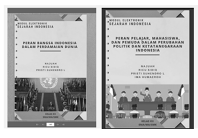
Figure 3. The covers page of the HEM

the content to make the material even more interesting, namely by changing the form of text material in the form of sound, image or video, determining the various applications needed in the next stage and drafting the historical electronic module. The media used to convey historical material during the learning process are the electronic history module and printed textbooks, and students use worksheets as supporting media in the learning process. The researcher produced the HEM design as a product of the historical electronic module's development, according to the subject matter for the selected essential competencies. The covers page of this product can see in the following figure 3.