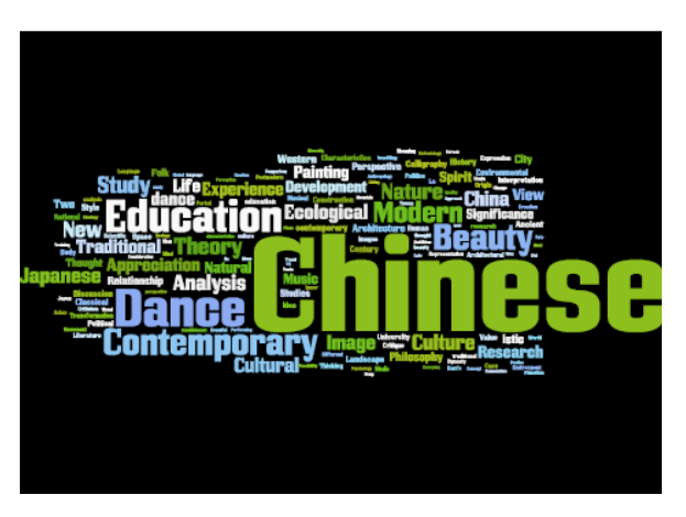
Illustration 3: Word Cloud 2

The various presentations were, as usual, structured as plenary or panel sessions and (more or less cohe-