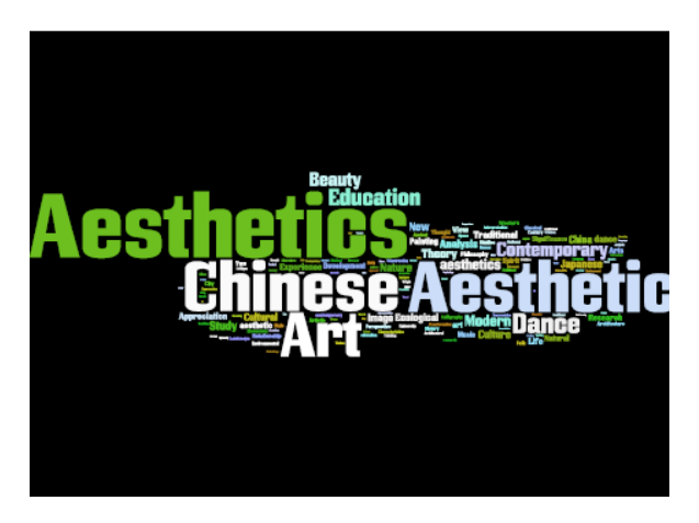
Illustration 2: Word Cloud 1

nese listeners). The attention and interest which the congress quite obviously received, not least within China, was certainly remarkable, and the fact that Yuan Guiren, the Chinese minister of education, gave one of the opening speeches might also be regarded as quite significant. Peking University, which has one of the best reputations in China (and indeed is ranked as nr. 47 on the QS University Ranking List)<sup>4</sup>, and its campus provided an excellent setting for the congress.