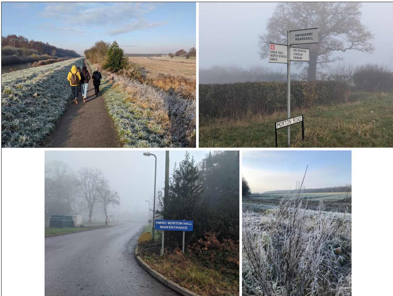
Figure 2b, c, d, e Testing the route to the IRC in November 2019, Mansions of the Future curatorial team.