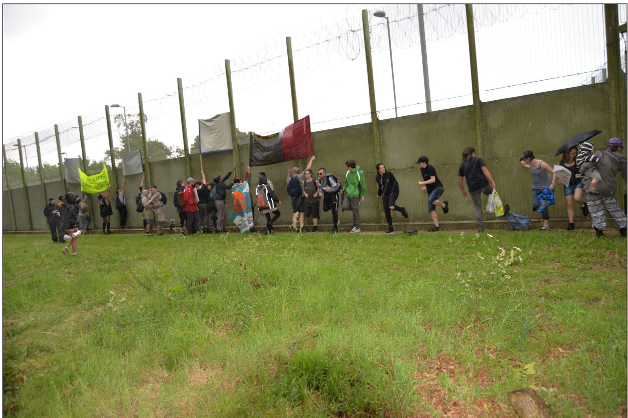
Figure 4 At the Perimeter Fence.