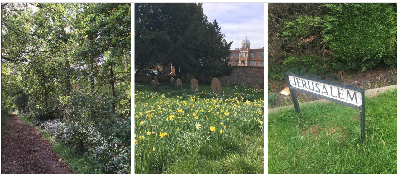
Figure 3a, b, c Walking to Morton Hall in Spring via Doddington Hall.

in 1585, five miles from the prison and a stopping point on the walking route to the Hall. The current buildings at Morton Hall are in no way beautiful or welcoming. They have the dour aspect of any prosaic prison block, enclosed by green metal fences and large quantities of razor wire. Yet, the prison is set in a very beautiful