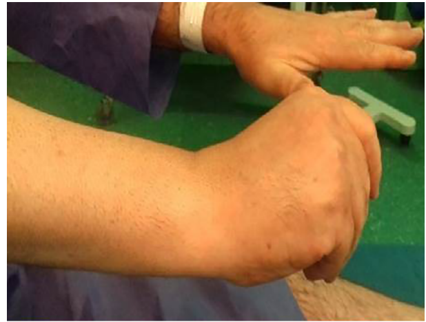
Figure 2. No active extension of all right fingers at the MP joint

of mature lipocytes without any cellular atypia. Active extension of all right fingers returned a year after surgery, as illustrated in Figure 6 .