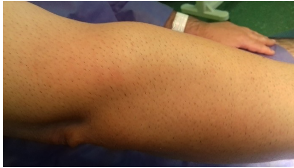
Figure 1. A non-tender soft mass on the right proximal forearm

the finger joints showed a full range of passive movement, notwithstanding normal active wrist extension and sensation. Magnetic resonance imaging of the right forearm illustrated a giant well-defined fatty lesion ( Figure 3 ).