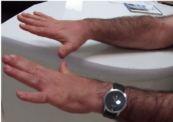
Figure 6. Active extension of all right fingers returned a year after the surgery