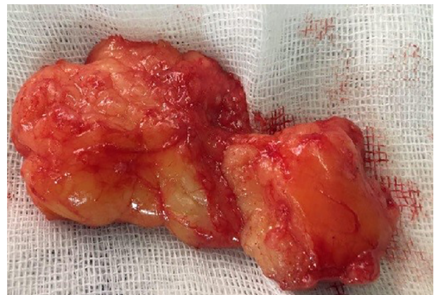
Figure 5. On gross pathology, a huge multilobulated well-defined irregular soft yellowish homogenously greasy mass was seen