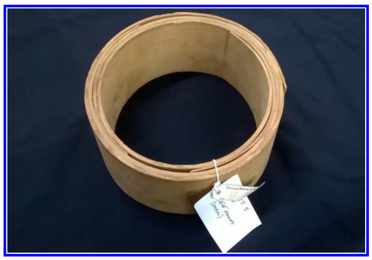
Figure 7. Sieve hoops of elm wood received from Kew in 1924.

aids and texts too. In 1924, Thomas's successor, Harold Augustus Hyde (1892–1973), received a collection of manufactured articles from home grown timber, thought to be from the 1924 British Empire Exhibition at Wembley and now in the wood collection at NMW (Figure 7). In total, Amgueddfa Cymru – National Museum Wales still has 93 of the 112 economic botany specimens donated by Kew in the 1920s.