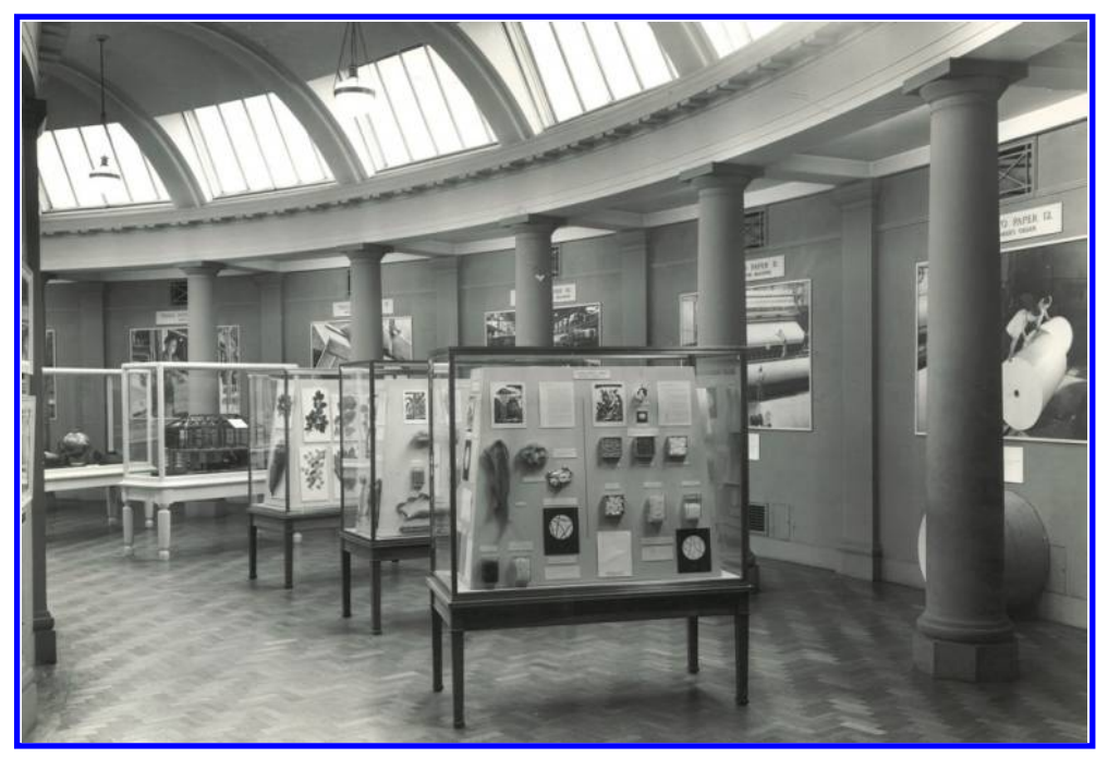
Figure 6. "Paper and its Uses" exhibition at National Museum Wales, Cardiff, 1958.

educational activities. One aim is to increase the number of native Welsh specimens, and, in the longer-term, there are plans to produce digital images of the specimens, accessible online.