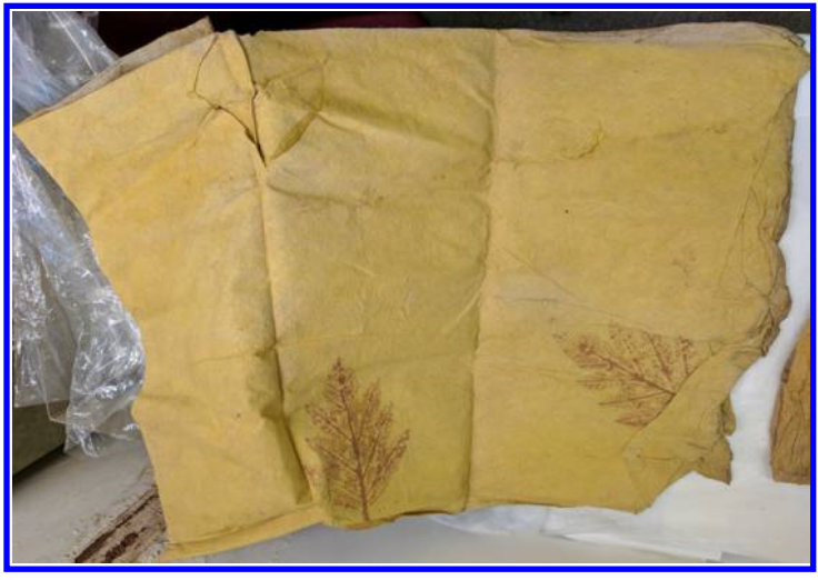
Figure 5. Barkcloth tiputa from Tahiti, collected by Prince Alfred in 1869 and now at Warrington Museum. Photograph by Mark Nesbitt. Reproduced by permission of Warrington Museum and Art Gallery (Culture Warrington).