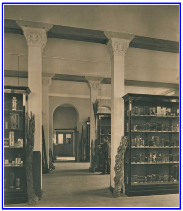
Figure 2. Cambridge Botanical Museum, 1904.

Downing site. The Botanical Museum, today used as the first-year teaching lab (Figure 2) was situated on the ground floor in a large, purpose-designed room.