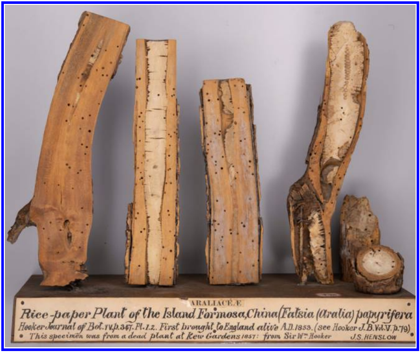
Figure 3. Specimens of Aralia papyrifera Hook. sent to J. S. Henslow by William Hooker in 1855 and now in the Cambridge University Herbarium and Cory Library.

two rooms were re-arranged according to monocotyledons and dicotyledons, as at Kew. Other elements of display were also redolent of Kew and with good reason: many of the framed botanical wall charts at Cambridge, for example, were donated by the Kew Museum (Gardiner 1904: 13). As Gardiner (1904: 17) said of wall charts, "they do much to decorate and enliven the whole collection, which might otherwise stand in some danger of being deadened and overweighted by the presence of many dried specimens." In 1888, teaching demonstrations also began to take place in the Museum, further marking it as a space of pedagogy.