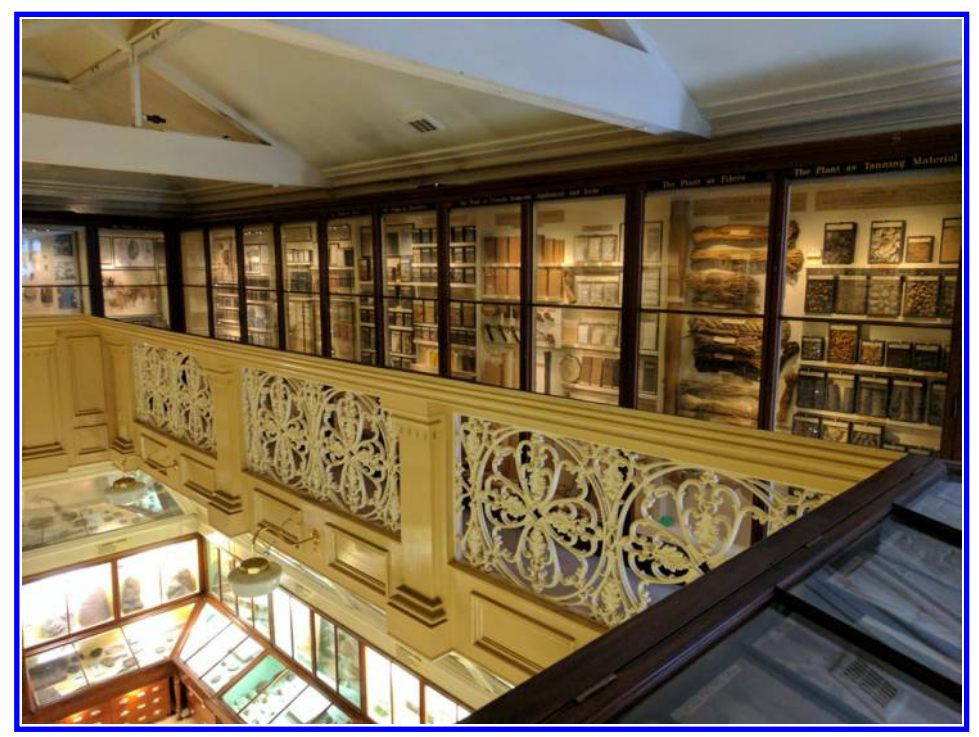
Figure 4. Botany Gallery, Warrington Museum.

the museum" (Madeley 1914). Madeley expanded the botanical collections in Warrington, transforming a reference collection into the basis of an educational museum display; central to this concept was the expansion of the economic botany collections.