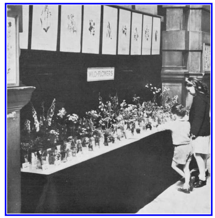
Figure 1. Annual display of local wild plants in Kelvingrove Museum, Glasgow, 1949.

Jones in 1976,<sup>11</sup> plants were represented solely in the summer display of wild flowers (Figure 1).<sup>12</sup> This annual exhibition was introduced by William Rennie, an amateur enthusiast, and subsequently maintained by members of the Andersonian Natural History Society.<sup>13</sup> "Habitat cases" were introduced in the 1980s in which models were used to represent plants; and in the 1990s the "Green Area" was an initiative at Kelvingrove to create interactive displays on environmental conservation. Living plants have featured strongly in various displays concerning, for example, the growth of trees, and plants used as dyes.<sup>14</sup> In the World Cultures collection, existing and more recently-acquired ethnobotanical specimens have been included in the "Charms and Healing", "Ancient Tea Horse Road" and "Life in the Rainforest" displays at Kelvingrove. Indeed, it is in these displays that Natural History and World Cultures once again come together. There are also botanical specimens in Kelvingrove's Environment Discovery Centre and the "Wild about Glasgow" displays which feature sections on taxonomic groups, food chains and seed dispersal.<sup>15</sup>