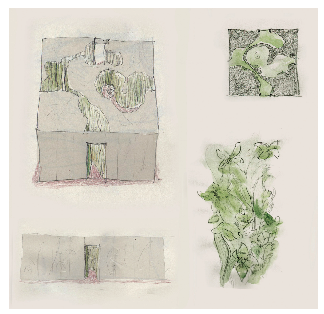
FIGURE 6 — Cristina Iglesias' Vegetation Room, site sketches, mixed media on paper.

never-repeated sound, and Iglesias', through its mirrored surfaces. When describing the "Sonic Pavilion", Rached (2014) states that it defies the expectations about art form by creating an illusion of limitless space between architecture and landscape. Both architectures make use of minimalistic forms, cylinder and cube, and both bear very organic art forms — art is fluidly enclosed within a rigid geometry.