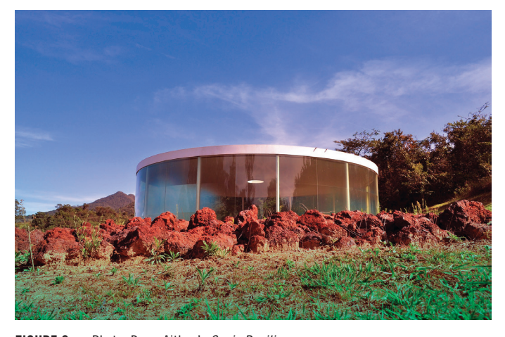
FIGURE 2 — Photo: Doug Aitken's Sonic Pavilion .

The reason why the "Sonic Pavilion" (Figures 1 and 2) and the "Vegetation Room" (Figures 3 to 6) were chosen as key examples is because art exists through architecture in both pieces. They present themselves inseparable from the built environment. If the building ceased to exist, the art would also be inexistent. Different from a traditional sculpture that could be transported from one building to another or built in the studio of an artist and then exhibited at different locations, these works and their galleries become one. Also, different from a simply large installation or sculpture where the piece itself is a freestanding structure, thus creating an environment in itself, these pieces are distinctive from architecture (as a bearing structure), which is precisely what permits the concept of artistic dwelling. Both pieces are in isolated buildings and this gives them a particular impression of oneness, since they are both one clearly marked space. There is no misapprehension as to their physical limits, though both pieces allude to the infinite, Aitken's, through