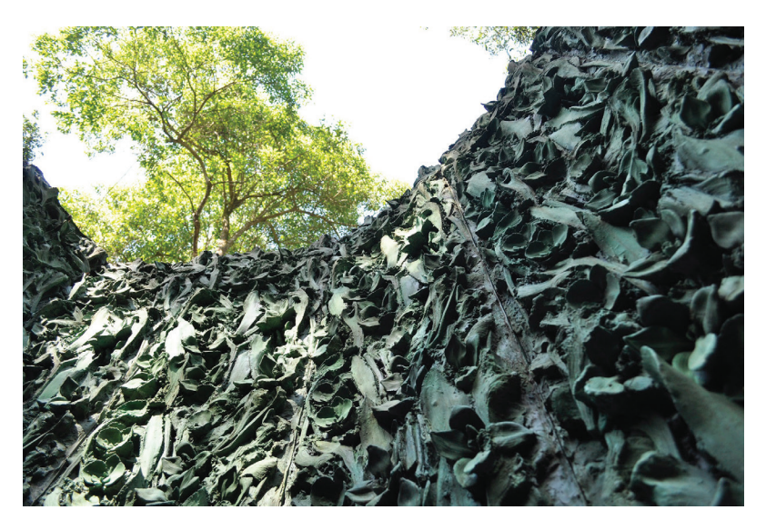
FIGURE 5 — Photo: Cristina Iglesias' Vegetation Room, inner walls engraved with vegetation.