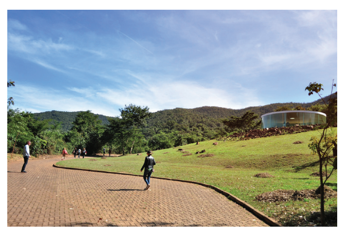
FIGURE 1 — Photo: Doug Aitken's Sonic Pavilion .

Therefore, the present essay on art and dwelling is thought of, but not limited to, graphic arts and within these to grand scale installations. This form of art embodies space and is an out-fold of sculpture in the contemporaneity (considering the time frame of 1990-2014). It necessarily deals with space and place, as it will become clearer throughout this essay.