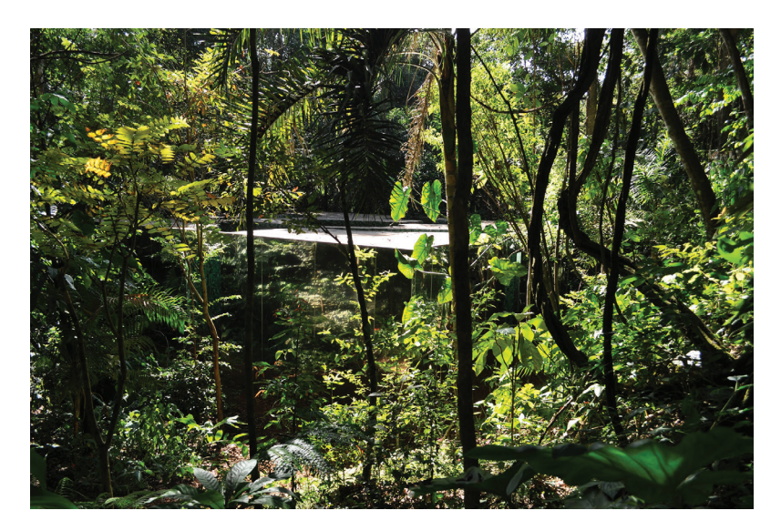
FIGURE 3 — Photo: Cristina Iglesias' Vegetation Room. Source: Personal collection of the author Liz Valente (2015).