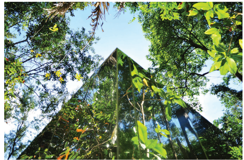
FIGURE 4 — Photo: Cristina Iglesias' Vegetation Room, stainless steel detail.