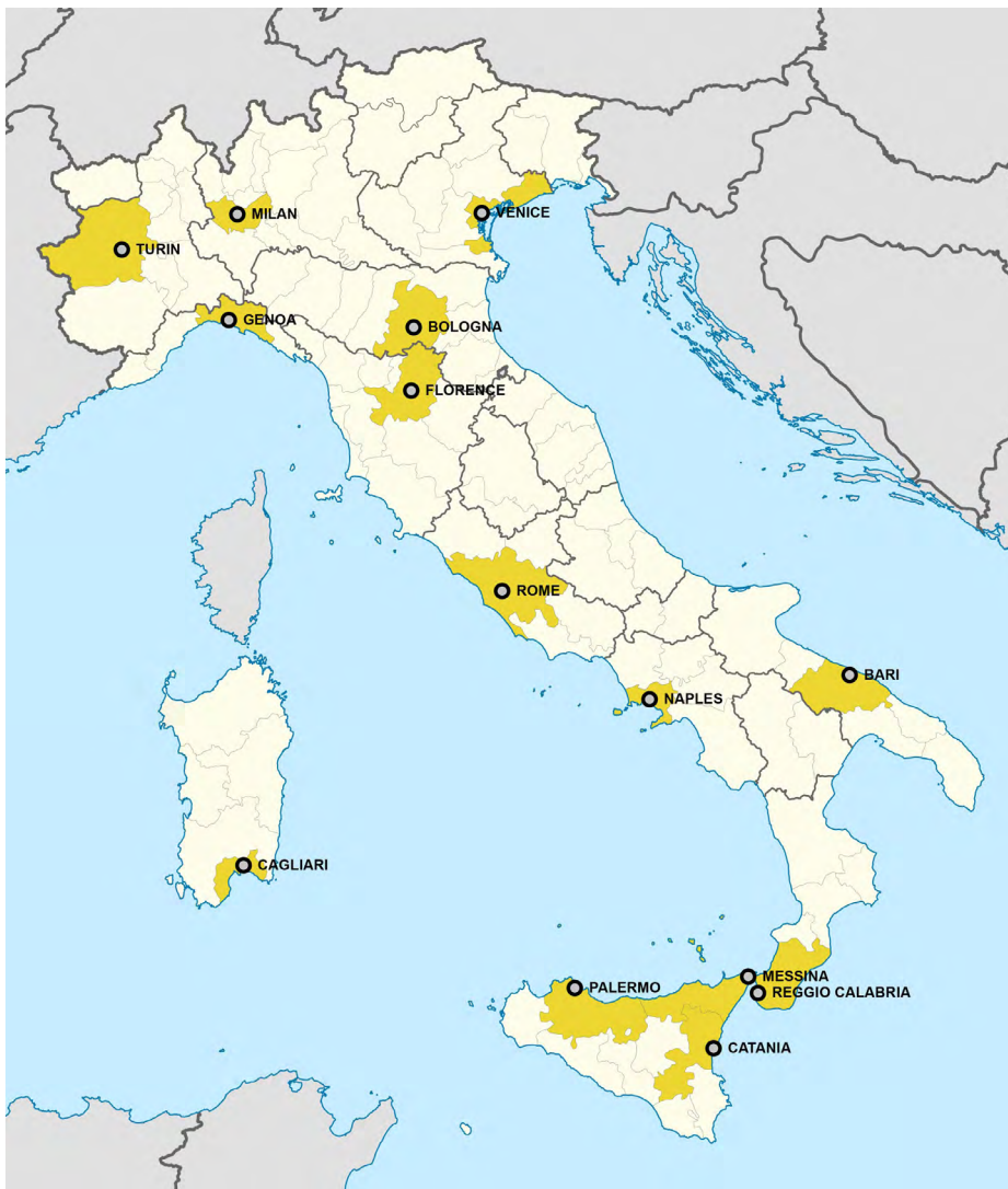
Figure 1: The 14 Metropolitan Cities in Italy with their respective institutional boundaries. In dark grey the perimeters of the 20 regions

The 14 metropolitan authorities created by the Delrio Reform (Law 56/2014) resulted in significant changes compared with Law 142/1990. As the earlier reform had proved ineffective, the Delrio Reform adopted a different approach: metropolitan cities were to be (a) directly identified by the State with (b) a territory that coincides with that of its related provinces 2 . In such cases, the province is replaced by the Metropolitan City and the reform is considered to be a move towards abolishing provinces within the national institutional system (Cammelli, 2011).