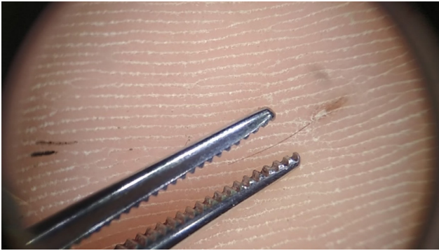
Figure 2. Introducing forceps between the dermoscope and the skin to grasp hair under vision.