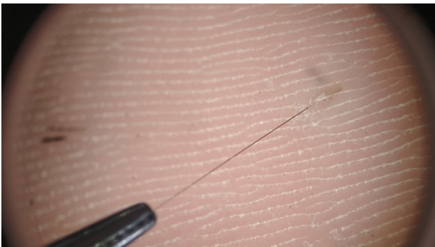
Figure 3. Forceful traction of hair resulted in stretching until its eventual avulsion.

at least doubled far beyond that of its seemed stretching limits. (figures 2&3).