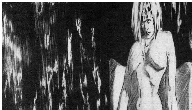
Figure 1 – Image cropped from “Slaying Militarism with the Pen” The Sketch , January 6, 1915.