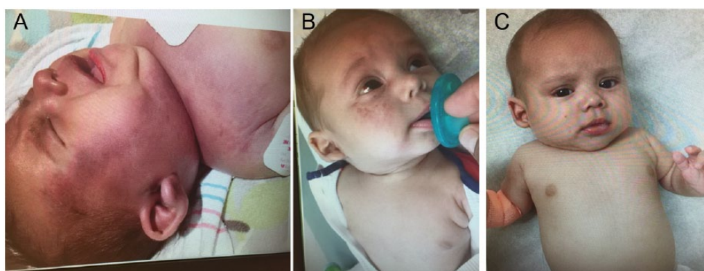
Figure 2. Classic clinical case of Kaposiform hemangioendothelioma with Kasabach-Merritt phenomenon (KMP) diagnosed in a 5-week-old patient. Extension of cutaneous involvement. Photos presented with mother's permission. (A) At the peak of activity of KMP (day 4)—patient with purpura, edema, irregular margins, and extensive size. (B) After 3 weeks of treatment, the cutaneous component improved significantly. (C) After 2 months of therapy with sirolimus and steroids, complete resolution of the cutaneous component was achieved.

transfusion (Figure 1) and the patient tolerated the procedure well with no complications. However, within 24 hours of the platelet transfusion, severe thrombocytopenia was again noted with a platelet count of 13 \times 10^3/\mu\text{L} . The patient received a PRBC transfusion on the day of presentation, prior to being diagnosed with KHE and KMP. Hemoglobin improved from 6.8 to 10 g/dL; however, within 4 days, it was again low at 7.4 g/dL (Figure 1). A second PRBC transfusion was administered prior to placement of the central line for hemoglobin of 6.1 g/dL with brief improvement to 9.1 g/dL.