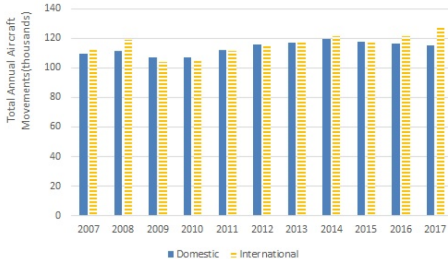
Figure 3. Total annual aircraft movements (domestic/international) at Oslo Airport Gardermoen:2007-2017. Source: data derived from [68].

a number of stakeholders on the production of jet biofuel for aviation in Norway. In addition, Avinor supports several research projects related to this, including in collaboration with SINTEF, BI Norwegian Business School, and the Norwegian University of Life Sciences [80] (p. 36).