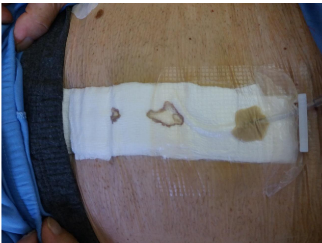
Figure 3. The vacuum dressing after 72 hours.