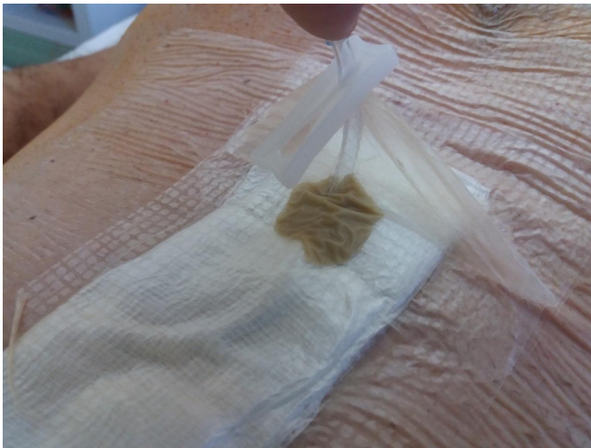
Figure 2. Two PVC film dressings adhered together over the orifice and around the drain to provide airtightness.