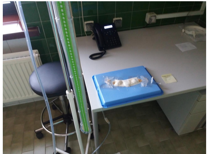
Figure 4. Dressing applied to the wound model with a liquid column to measure negative pressure.