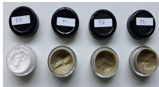
Figure 1. Organoleptic Result of Maja Cream

resulting odor of the three formulations smelled like typical extracts. From Figure 1, it can be seen that organoleptically, the more the concentration of the extract, the darker the cream color. The color that appears on the cream matches the color of the Maja leaf extract.